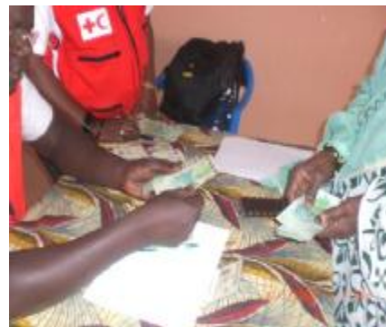
Distribution of seeds and cash to affected families