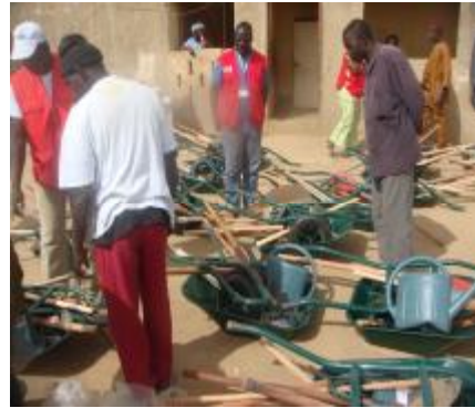
Livestock and agricultural kits distributed to beneficiaries