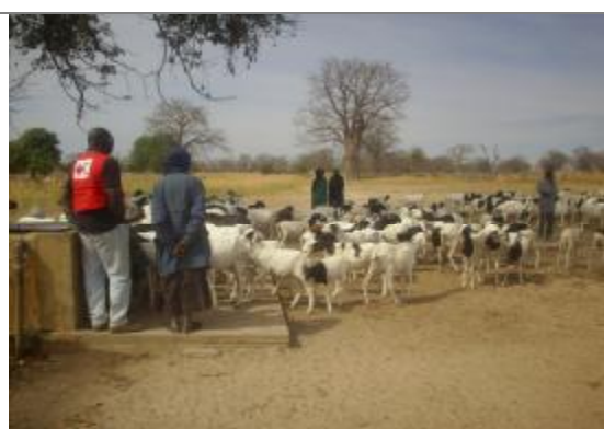
Livestock support to affected families

Following the development of a revised plan of action based on the resources available in partnership with the Senegalese Red Cross Society (SRCS), this preliminary response provided agricultural tools, seeds, fertilizers and cash distribution to 1,546 beneficiaries. However, there remains to cover up to 1,254 more families.