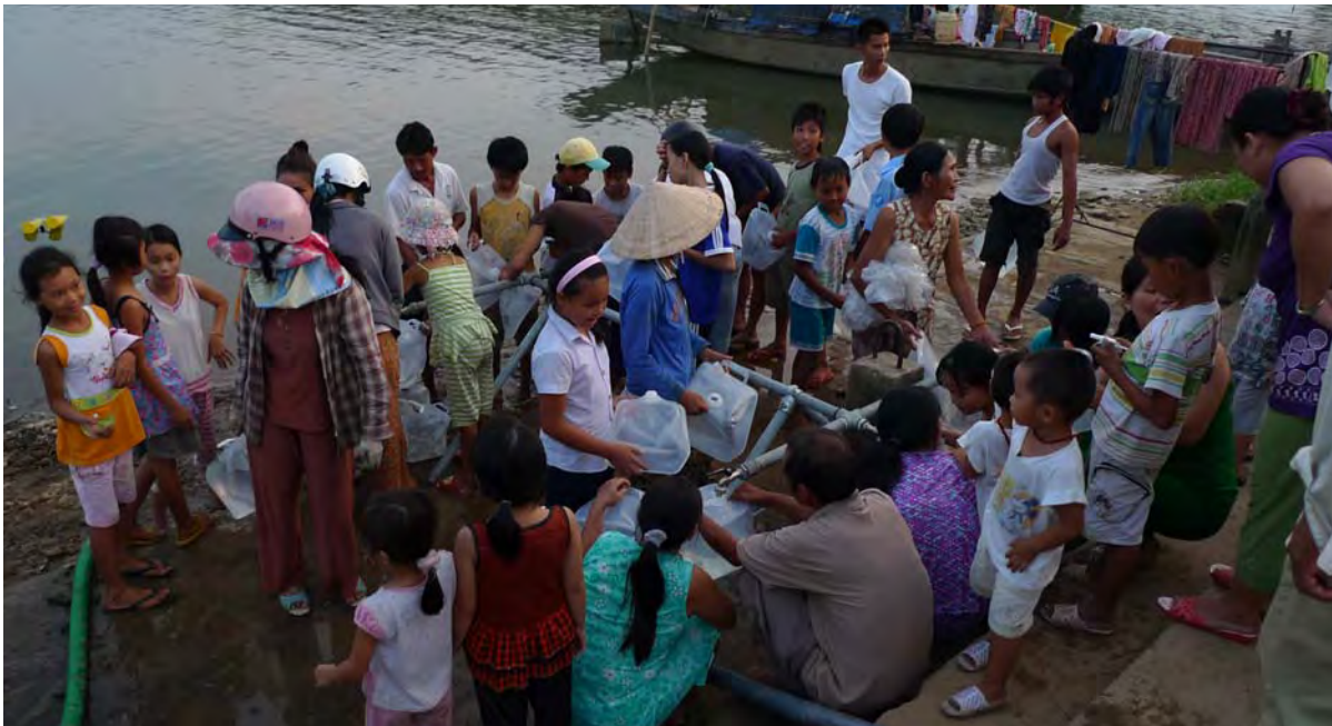
Viet Nam Red Cross, with support from the Australian and German Red Cross, provided up to 70,000 litres of clean water between 3 – 5 October to affected communities in An Loc commune, Phu Loc district, Hue province.