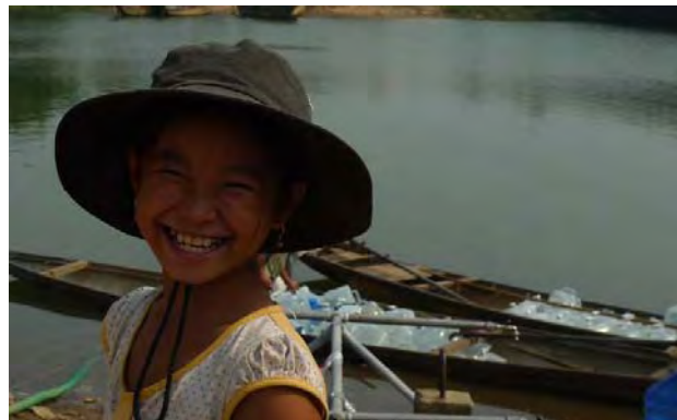
Local spirit: this young Vietnamese girl travelled by boat with members of her community to get water supply from the Viet Nam Red Cross-operated water treatment unit for up to 140 households in her hamlet of Chau Thanh, An Loc commune, Phu Loc district, Hue province.

Progress: VNRC's Australian Red Cross-supported water treatment unit is producing clean water for the affected people in Loc An commune, Phu Loc district, Hue province. The unit has been operating since 3 October, with technical assistance provided by water and sanitation delegates from German and Australian Red Cross. Approximately 70,000 litres of clean water have been produced from between 3- 5 October for the villagers. About 1,000 people are estimated to benefit from this support each day. It is the VNRC's first experience in providing this support to affected communities. There are lessons learnt in terms of needs assessment and recording for VNRC in the coming days.