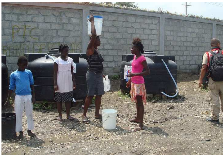
Parc La Couronne, a former sports field is one of the over 600 temporary settlements formed since 12 January's Earthquake. The ERU's are supporting this settlement with clean water and hygiene promotion activities.

Vincent and Automeca settlements. Activities include latrine installation solid waste management and hygiene promotion. Four prototypes of tank latrines have been installed in La Piste. Beneficiary response has been good, and the new latrines are preferred to the trench latrines. Beneficiary feedback is being used to improve the system. The Finnish Red Cross has built 400 latrines throughout 9 sites. To date, the French Red Cross has installed 570 latrines and 190 showers throughout 14 sites in Delmas and in the Cité Militaire. Hygiene promotion activities accompany the installation of the facilities. The Spanish Red Cross MSN20 continues to build trench latrines in 5 camps where 96 latrines have been completed. Red Cross hygiene promotion activities are also being carried out in 9 camps.