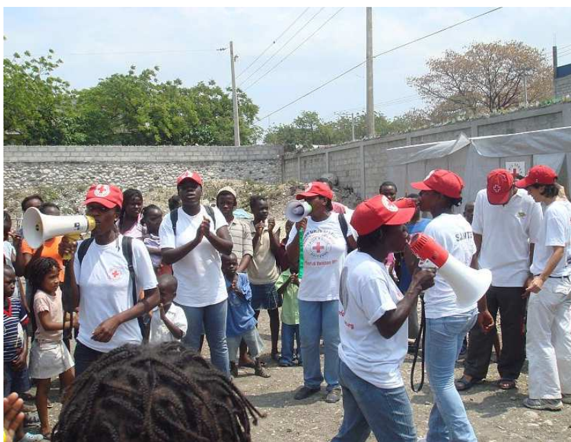
17 March 2010. The Haitian National Red Cross Society health promotion team carried out actions in Parc La Couronne, Port au Prince, Haiti.

Two months following 12 January's devastating earthquake the activities of the Red Cross/Red Crescent Movement are clearly visible throughout earthquake affected communities in Port-au-Prince and south - western Haiti. Red Cross trucks transporting water and relief items can be spotted at all times of the day on the roads traversing the affected areas. Over ten thousand Haitian National Red Cross volunteers are active supporting the International Federation teams including the Emergency Response Units (ERUs) with assessments and distributions, as well as reaching out to communities with important information about key health measures that will assist in protecting the health and psychological well being of families living in temporary settlements. The combined efforts of Movement actors, as indicated below, has provided tens of thousands of people with critically needed health care, relief and shelter items. Additionally, all Movement actors have played an important role in advocating on behalf of the affected population and providing constructive international media coverage of key issues.