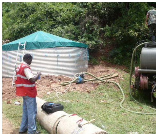
TRCNS WatSan Officer testing water from Red Cross tank in Kilosa.

The TRCNS has set up two 10,000 litre and one 2,000 litre tanks in Mazulia Camp with a total of 13 taps installed. In Kimamba Camp one 10,000 litre and one 2,000 litre tank with 8 taps have been installed. Low flow water dispensers have also been installed at latrines to support hygiene promotion.