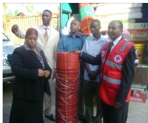
TRCNS Secretary General (in Red Cross Jacket) receiving support of non-food items from Tanzania Professionals Network.

The Tanzania Red Cross National Society (TRCNS) has been working closely with the Government of Tanzania and United Nations Children's Fund (UNICEF) in providing emergency relief to the affected communities. The TRCNS volunteers have been active in both the Mazulia and Kimamba displacement camps conducting hygiene promotion, distributing non-food items (NFIs) and providing 36 cubic meters of treated water per day. Additional 839 emergency shelter units are required and TRCNS is mobilizing shelter kits and construction materials to the affected areas to address this gap.