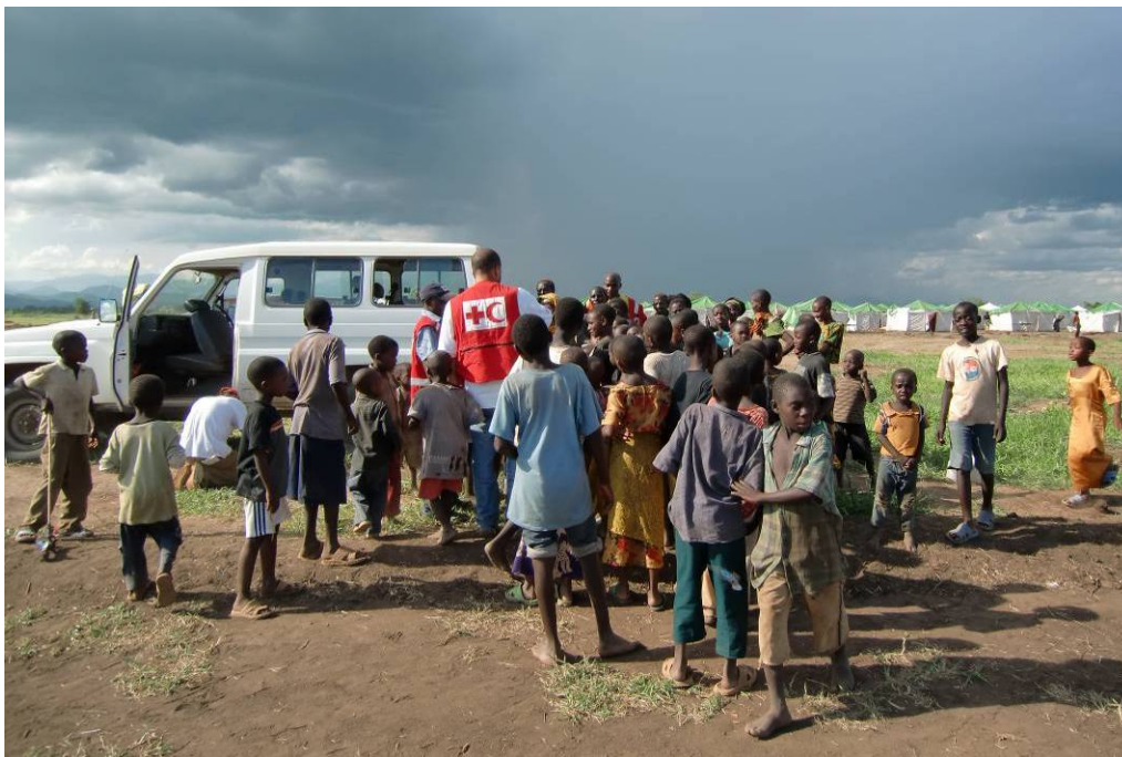
Children in the Kimamba Camp gather around for a Hygiene Promotion session by a Red Cross Delegate as the afternoon rains approach in the distance.

The Government of Tanzania has established two displacement camps (temporary settlements), with a third being planned, in Kilosa District and displaced people are currently being evacuated from schools to allow education programmes to continue. Both camps are currently being supported by the local authorities with the help of the Tanzania People's Defence Force (TPDF) and the Tanzania Red Cross National Society with support from the International Federation and Partner National Societies (PNS).