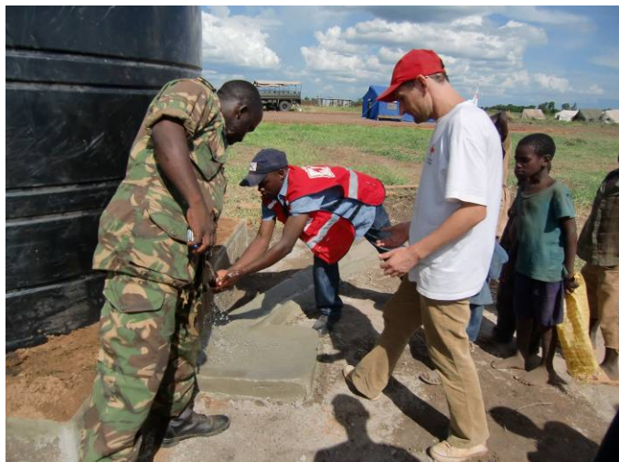
TPDP and Red Cross Delegates test newly installed water tank in Kimamaba Camp.

Tanzania People's Defence Force coordinated water and sanitation interventions with the TRCNS and provided support in building platforms for water tanks, constructing latrines and bathing stations, as well as providing water trucking of TRCNS treated water.