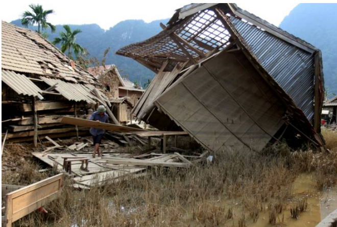
9 October 2010: Floodwaters washed away foundations causing houses to collapse in the Tan Hoa commune, Minh Hoa district, in Quang Binh province.

The situation in this area continues to worsen as very heavy rainfall in central Viet Nam since 14 October has caused additional flooding in the provinces of Nghe An, Ha Tinh and Quang Binh.