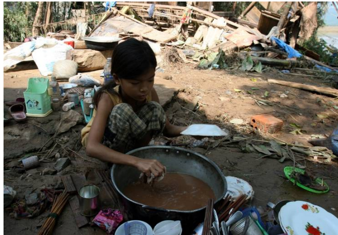
After their home was swept away by flood waters in the Xuan Tien village, Son Trach commune, Bo Trach district Quang Binh province, this 10-year-old, her two siblings and their parents will receive relief assistance from VNRC.