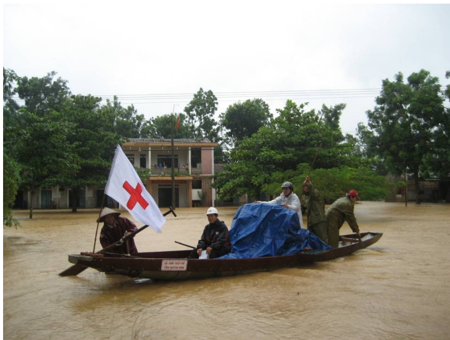
A VNRC rescue boat in Quang Binh with Red Cross chapter staff delivering instant noodles and drinking water to affected families in Tien Hoa commune, Tuyen Hoa district, Quang Binh province on 5 Oct 2010.

Furthermore, Typhoon Megi, currently heading towards Philippines, is expected to make landfall as a Category 5 super typhoon. Following this, Megi is expected to head towards the Vietnamese coastline in the coming week and seriously worsen the current flood situation.