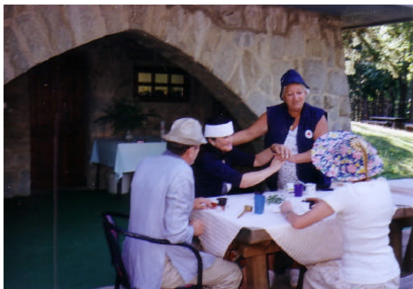
Home care volunteers training

Following the recommendations of the evaluation of the programme done in the first half of 2005, a plan was devised for the improvement of the programme performance as well as a more equitable approach to branch support. A series of five training sessions (covering all the programme branches) was provided in order to support the branches in performing a new, thorough assessment of needs. Based on the participatory methodology, this assessment, done between November and January was used to reach deeper understanding of the needs in the field, as perceived and expressed by the population the programme was created to assist. Moreover, the emphasis was put on the comprehensive approach as to map not only the local needs but capacities and opportunities as well. Involving the representatives of the communities (social welfare centres, health institutions, local government) in certain cases resulted in joint plans of action. Upon finishing the assessment, the branches were invited to apply for additional donor support with projects resulting from the assessment process. The intention is to support new, innovative projects in well developed branches, which will improve and expand on the existing programme and create sustainable activities that will be adopted by their respective communities. On the other hand, less developed branches are given additional support as means of helping them bridge the gap and catch up with the rest.