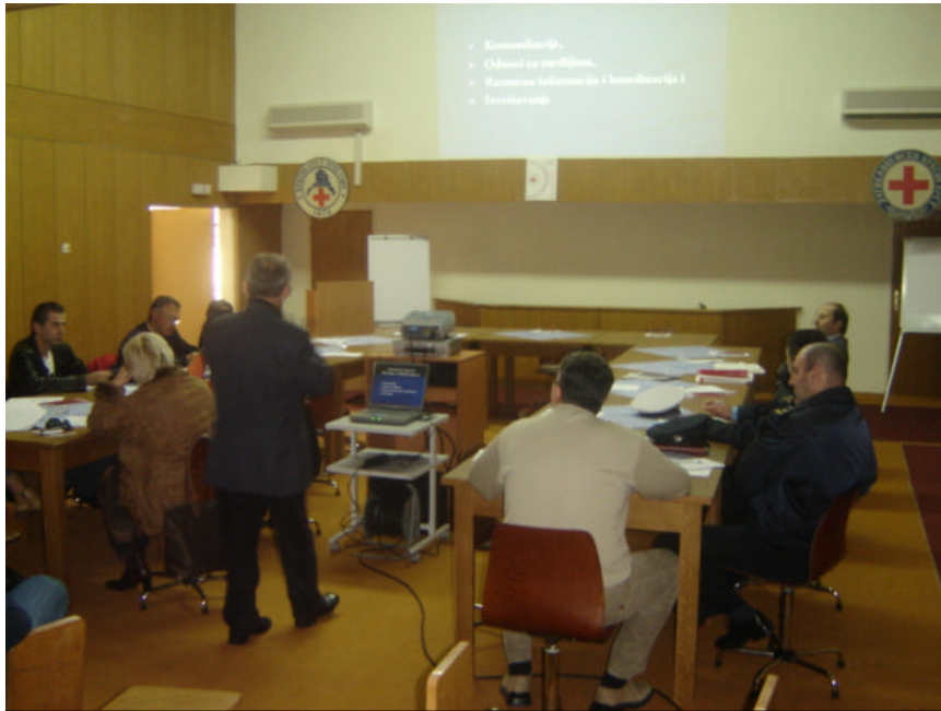
Municipal DP simulation in Podgorica