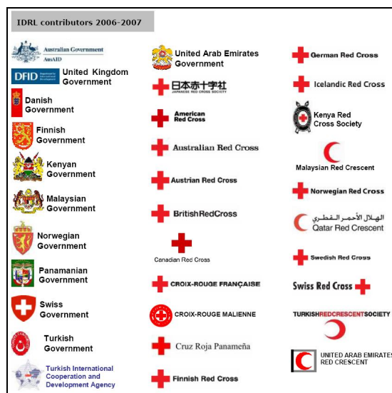
IDRL contributors for the year 2006-2007

In a world of global challenges, continued poverty, inequity, and increasing vulnerability to disasters and disease, the International Federation with its global network, works to accomplish its Global Agenda, partnering with local community and civil society to prevent and alleviate human suffering from disasters, diseases and public health emergencies.