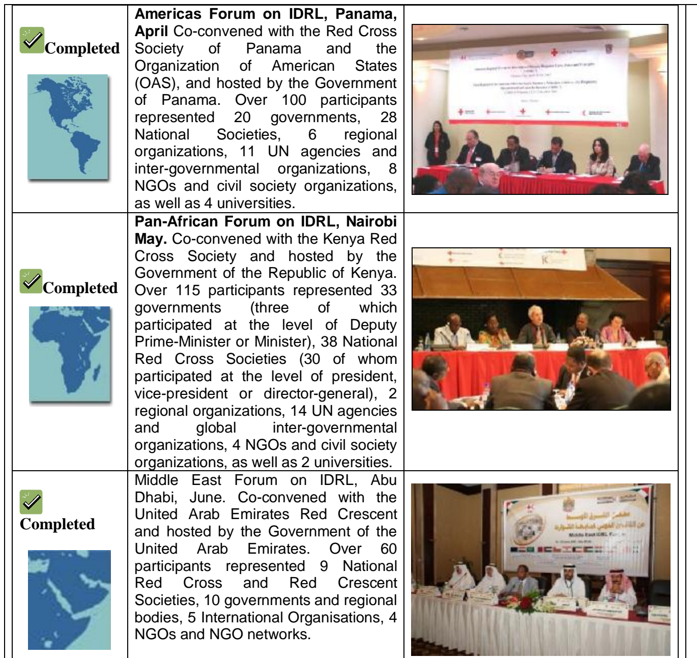
Table 3: Recent Results

In direct preparation for the 30 th International Conference, three new regional consultative forums on IDRL were completed this year, after the organization of the European and Asia-Pacific forums on IDRL in 2006. These IDRL Forums have focused on building consensus among major stakeholders involved in disaster response. Through the substantive and working group sessions, a wide variety of stakeholders have had direct input into the progressive shaping of the Draft IDRL Guidelines. For more information on the regional forums, please refer to http://www.ifrc.org/what/disasters/idrl/advocacy/regional.asp