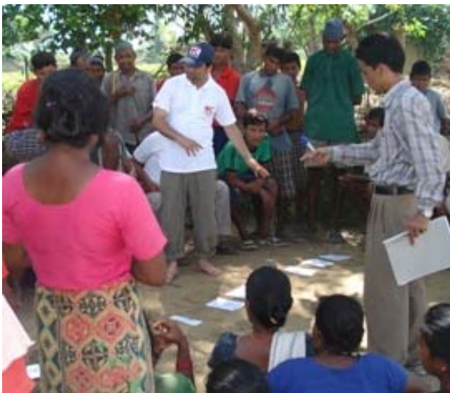
The regional DRR officer facilitating a community discussion as part of the development of a monitoring plan for the Nepal Red Cross floods operations.

Project objective: Regional capacity and systems are improved to respond effectively and efficiently in times of disasters, and to ensure seamless transitions to recovery.