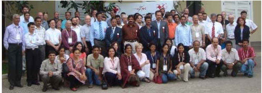
The participants of the ground-breaking OD/ DM/Health joint forum, and the 18 th session of the South Asia secretaries general forum, which took place in Sri Lanka at the end of October.

The most significant area of progress was towards integrated programming 8 . The benefits of programmes working in a more integrated manner in planning and implementation have been increasingly emphasized by the regional office, forming a cornerstone of its plans for 2008-2009.