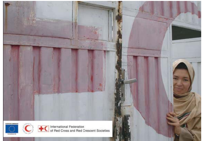
A postcard with a female Afghan Red Crescent volunteer, one of the visibility materials developed for a community-based disaster management project, supported by a partnership between ECHO, Danish Red Cross and supported by the Federation regional and Afghanistan delegations.

Support for the information campaign for the creation of the Maldivian Red Crescent included providing holiday cover for the communication delegate, facilitating the production of 2,000 copies of a brochure in English and Dhivehi and a poster on HIV/AIDS.