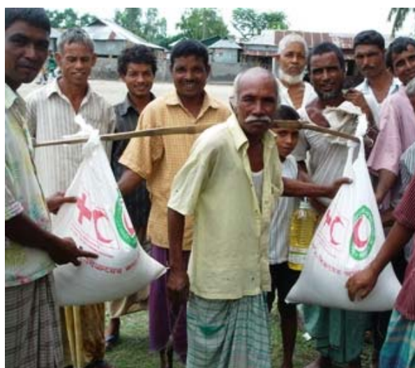
Dry food supplies being distributed during the flood operations in the Lalmonighat district of Bangladesh, where the regional office's DRR officer visited to analyze the links between community-based disaster management and the flood response operations.

The project aims to draw together regional experiences and knowledge to harmonize and standardize Red Cross Red Crescent risk reduction trainings, systems and tools while strengthening cooperation with other vital actors in the region at local and national levels. To date, a project manager has been recruited, visibility and promotional materials have been produced and the first activity, the organizing of the regional disaster management working