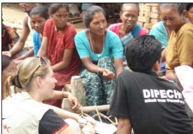
A community discussion being held as part of the South Asia regional office's monitoring visit to Nepal, with the regional advocacy delegate and a member of Nepal Red Cross disaster management department.

In a world of global challenges, continued poverty, inequity, and increasing vulnerability to disasters and disease, the International Federation with its global network, works to accomplish its Global Agenda, partnering with local community and civil society to prevent and alleviate human suffering from disasters, diseases and public health emergencies.