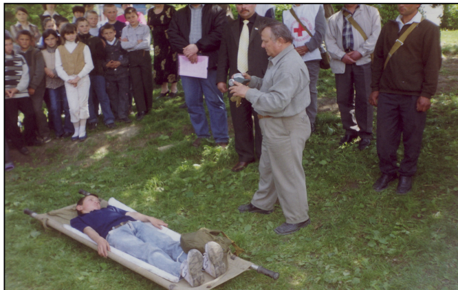
The Moldovan RC trains the citizens of Calarash, Moldova at a field training in June 2006

Expected Result 3: Public awareness on hazards and community DP/DR capacity in the most disaster prone is increased.