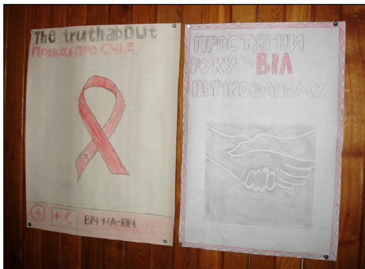
An anti-stigma poster prepared by adolescents from the correctional institution Trade School of Social Rehabilitation for Teenagers is displayed in the village of Jakushnvtzi, Vinnitsa Region, Ukraine

Expected Result 2: Young prisoners master basic principles of healthy lifestyle, HIV prevention; they have more regard for their health.