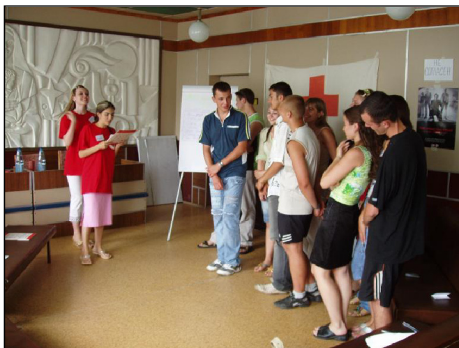
Youth peer educators conduct a session in Poltava, Ukraine

Expected Result 1: Selected regions have a functioning team of young peer education trainers (14 trainers in seven regions).