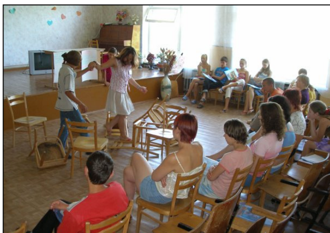
Youth in Belarus participate in a game organized by Belarus RC volunteers at an HIV/AIDS educational session

Expected Result 2: The number of young people equipped with appropriate knowledge and skills to change risk behavior regarding HIV/AIDS is increased.