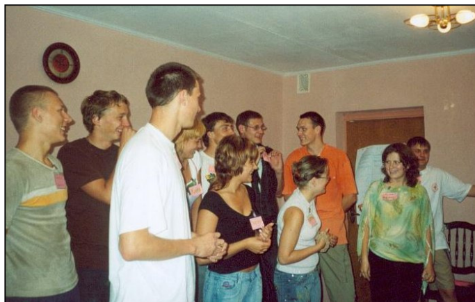
Youth volunteers from Belarus, Ukraine, and Moldova gathered in Minsk, Belarus in August to share their creativity and enthusiasm at a cross-regional training and competition

This two-year programme addresses poor youth involvement and lack of sub-regional youth cooperation in the Belarus RC (BRC), Ukraine Red Cross (URC) and Moldova Red Cross (MRC). 2006 is the second year of programme implementation. In August, a competition for the best volunteer teams from all three countries was held at a cross-regional seminar in Minsk. The competition focused on three areas: HIV/AIDS prophylaxis, International Humanitarian Law, and First Aid. Courses were organized in such a way that every participant had the possibility to attend all master classes, and improve their knowledge in each of the three areas. The youth volunteers participating at the event were able to share creative ideas from their work, and reported great satisfaction and renewed enthusiasm upon their return home.