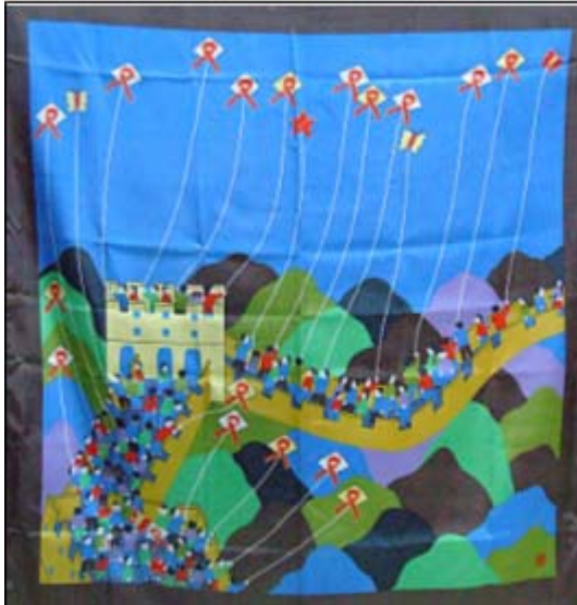
A silk scarf which was designed as part of the Red Cross 'Kite' fundraising programme. International Federation.

An open forum panel discussion for foreign residents in Beijing on the HIV/AIDS situation in China was organized in April to increase visibility and support for Red Cross projects on HIV/AIDS in China. The target group was the foreign press corps in Beijing, but the event also attracted many NGOs and scholars working on HIV/AIDS.