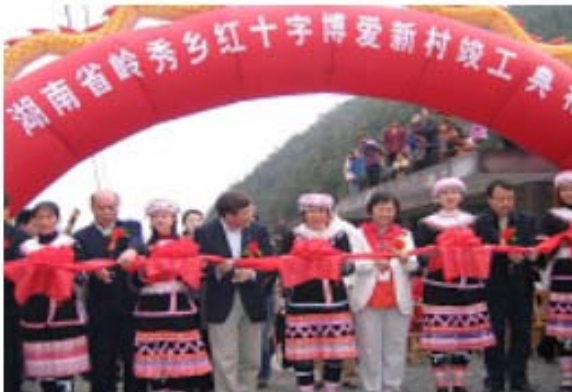
The opening ceremony of the Hunan reconstruction project.

A disaster preparedness (logistics) workshop organized by the regional DM programme took place on 21-23 March 2007. Some 26 participants were chosen from six RCSC regional and provincial disaster preparedness and relief centres. The workshop systematically introduced topics such as warehouse selection, warehouse forms, warehouse procedures, warehouse management and transportation according to the Federation and international standards. All participants took part in several group exercises to practice the knowledge learned from the class. This is the first capacity building workshop focusing on logistic warehouse management. The training was facilitated by the regional logistics coordinator from the regional logistic unit in Kuala Lumpur.