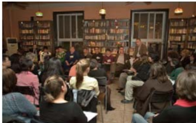
The Red Cross HIV/AIDS panel discussion was held in Beijing. International Federation.

RCSC staff from headquarters and provincial branches and the HIV/AIDS delegate attended a workshop arranged by UNFPA focusing on peer education among sex workers. This workshop provided an opportunity to learn more about working with new target groups, which RCSC is interested in pursuing as they move beyond youth peer education in universities.