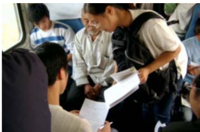
Volunteers from Shandong Red Cross branch sharing information on HIV/AIDS on trains during the trauma campaigns. International Federation.

Achievements: With the global alliance on HIV/AIDS launched at the end of 2006 and the first programming meeting having taken place in Bangkok in March, the Federation and the RCSC have moved forward on creating an HIV/AIDS operational alliance (HIV OA) in China. The concept was introduced and discussed at the East Asia regional delegation (EARD) partnership meeting in April and both the national societies and partners expressed interest and commitment to establishing an HIV OA within the year. The first strategic planning meeting will take place in Beijing in June.