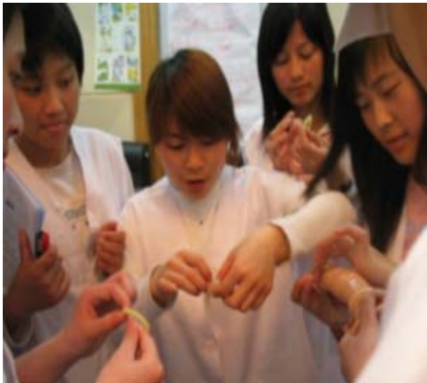
Training of trainers' participants learning how to demonstrate proper condom usage. International Federation.

In January, a meeting was held with the Swedish Red Cross to discuss their support towards the RCSC HIV/AIDS programme. The meeting resulted in a detailed plan of action for the programme in Shandong and Henan. As some funding source reduce for this programme by the end of 2008, alternative funding sources were discussed.