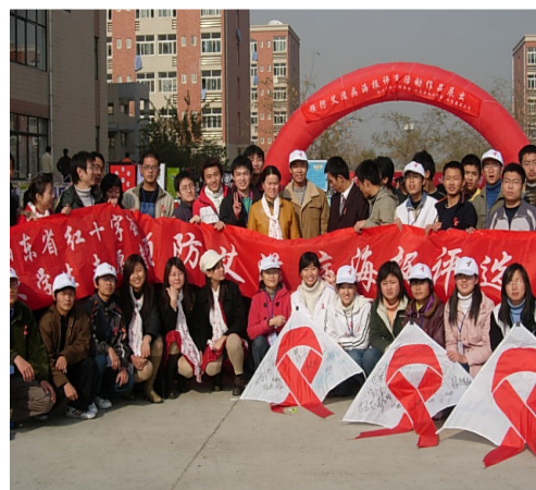
World's AIDS Day celebration and HIV/AIDS art contest with Shandong Red Cross branch. International Federation.

In a world of global challenges, continued poverty, inequity, and increasing vulnerability to disasters and disease, the International Federation with its global network, works to accomplish its Global Agenda, partnering with local community and civil society to prevent and alleviate human suffering from disasters, diseases and public health emergencies.