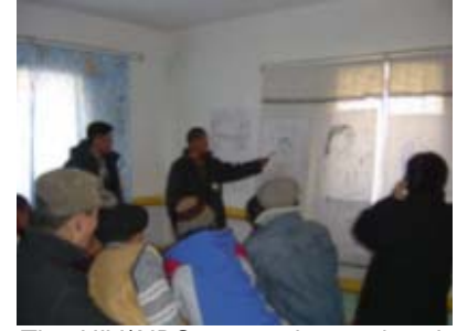
The HIV/AIDS prevention project is currently being implemented in two male prisons.

The prevention project titled “Lets go back home healthy” commenced its second phase in two male prisons located in Tuv province and Baganuur district of Ulaanbaatar respectively. Thirty people including the prison authority, guards and social workers were involved in the HIV/AIDS sensitization training on 14-15 March in Baganuur district and 22-23 March in Tuv province. The training aimed to create a better understanding of the current situation, re-establish a project support group, and increase the involvement, commitment and support of prison authorities. Participants in their training demonstrated a 35 per cent increase in knowledge at the end of the course.