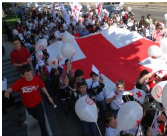
Georgian Red Cross volunteers marching in Tbilisi on the International Red Cross and Red Crescent Day. International Federation

This report covers the period 01/01/08 to 30/06/08.