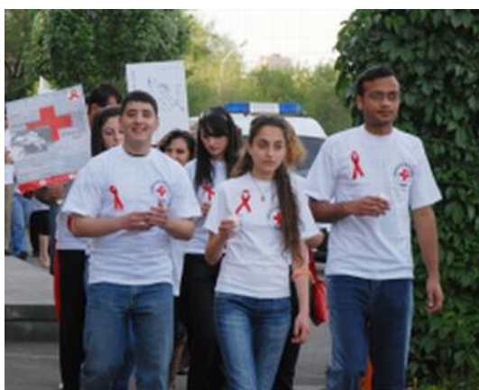
Armenian Red Cross volunteers celebrating AIDS memorial day on 18 May. International Federation

The Azerbaijan Red Crescent health promoters disseminated information on preventive health to 3,125 children with disabilities, orphans, youth, women and elderly people. As a result of the activities 85 women registered for and underwent medical examinations which uncovered 6 cases of mastopathy, 11 cases of breast cancer and 121 cases of anemia. Furthermore timely immunization of children resulted from joint prophylactic events by the Red Crescent and the Ministry of Health.