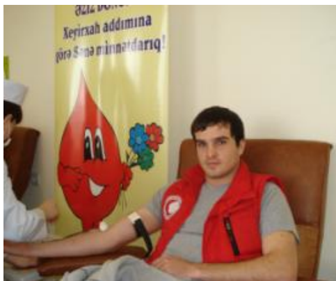
Young Azerbaijan Red Crescent volunteer is giving blood on behalf of children ill with thalassemia.

Furthermore the National Societies in Azerbaijan and Armenia implemented activities targeting former inmates with TB, encouraging them to continue treatment on a regular basis and to complete it as well as providing them with social support and information. In Armenia the activity was supported by the Global Fund to Fight AIDS, Tuberculosis and Malaria (GFATM).