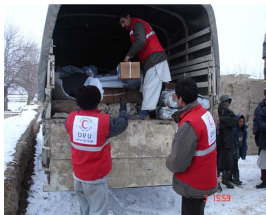
Afghan Red Crescent provincial disaster response unit assists the affected population during the harsh winter in February.

This report covers the period 1 January 2008 to 30 June 2008