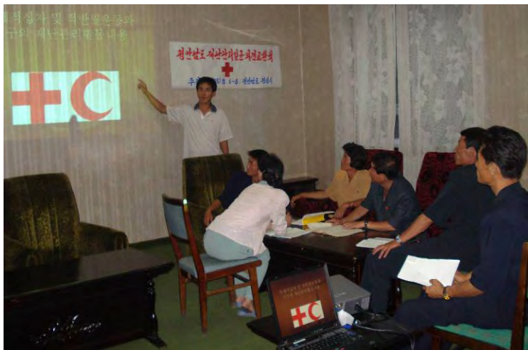
A community-based disaster preparedness workshop in South Pyongan province in July 2008. International Federation.

The DPRK Red Cross's disaster response operation ( Appeal no. MDRK001 ) following the floods in 2007 was fully concluded and closed. A total of 23,000 family kits of disaster preparedness stocks distributed during the emergency phase of the 2007 flood relief operation were fully replenished while additional pre-stocking of 2,000 family kits are under procurement and shipping to the DPRK. Disaster management workshops at county levels took place to capture past experiences and expertise to further improve disaster risk reduction activities. Up to 50 additional communities neighbouring the initial 50 community-based disaster preparedness projects have been selected by collective efforts made from all stakeholders (national, provincial and county level) for the community-based disaster preparedness replication phase.