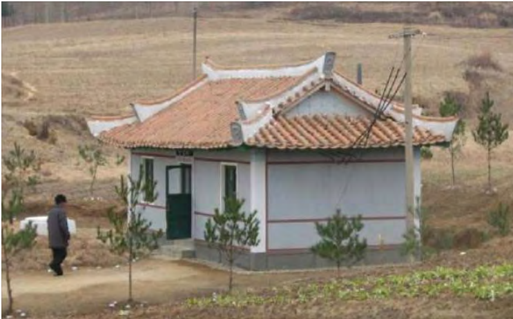
A pump house that was part of the water and sanitation project in Tongjung Ri, South Hamgyong.

maintenance purposes and at least in one water system the management is trying to supply water to the community on a 24-hour day basis. The exteriors of the pump houses, sources and reservoirs are nicely finished and freshly painted, with all pump houses and reservoirs having a proper protection zone, and in many cases, lined with newly transplanted pine tree saplings.