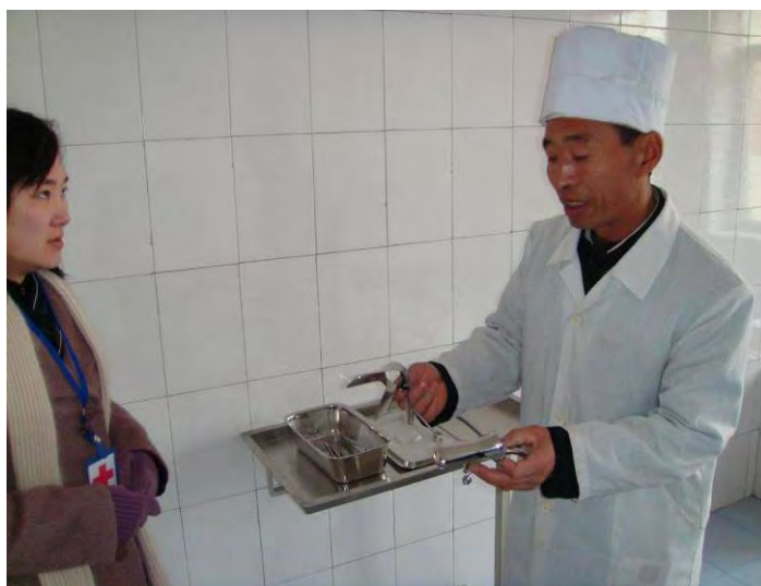
An Unsan County hospital doctor discusses with a DPRK Red Cross staff about the safe delivery of kits distributed by the national society and the International Federation and partners.

Red Cross supported drug distribution to the same affected areas to prevent malnutrition and increased morbidity in the next 15 months.