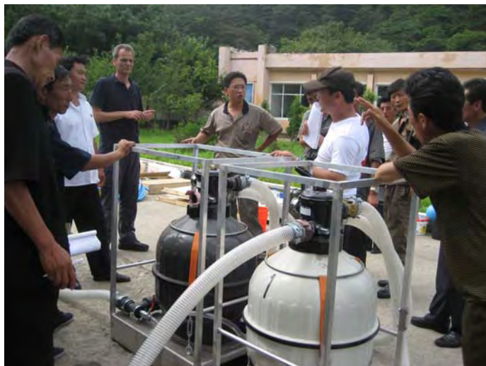
Emergency water and sanitation training in Pyongsong city in July 2008. International Federation.

The participants were trained on the operation of emergency water systems including the Scandinavian EmWat 4000 water treatment unit and the Spanish SETA units. As part of this response programme, 2,000 hygiene kits were procured and stored in the Red Cross warehouse.