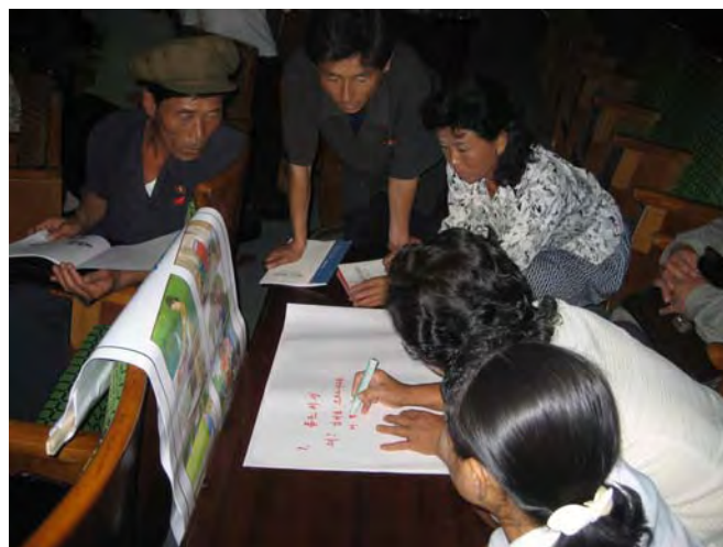
Group discussion during PHAST and water-borne disease prevention workshop in Hamheung city, South Hamgyong August, 2008.

respective communities, consisting of Red Cross volunteers, health workers and school teachers. The participants will in turn further disseminate hygiene promotion to their communities using the PHAST methodology, in close cooperation with the community health institutions.