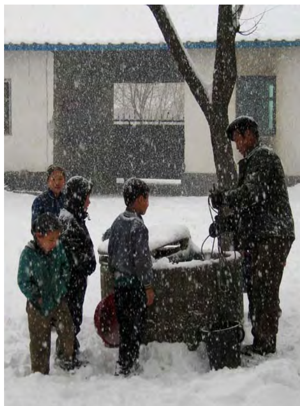
DPRK children surround a water well at the first snowfall in November.

This report covers the period 01 July 2008 – 31 December 2008.