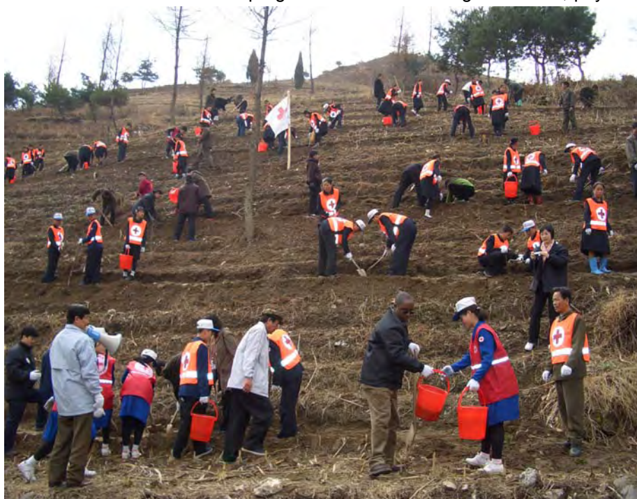
Red Cross Youth participating in tree-planting activities in South Pyongyang. International Federation.

In autumn, a Red Cross youth tree planting campaign was organized in 100 communities (50 current and 50 replication) in collaboration with the Red Cross branches and county-level seedling nurseries. Working tools like spades, water