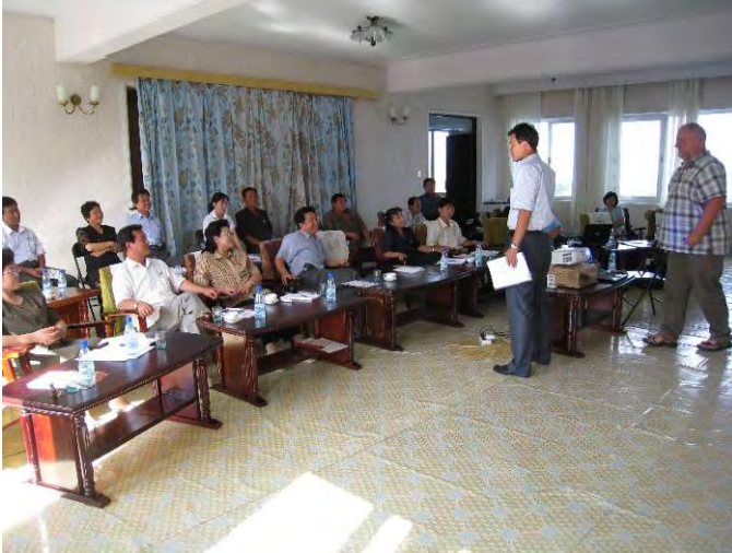
An organizational development workshop was held in South Hamgyong province in August 2008. International Federation.