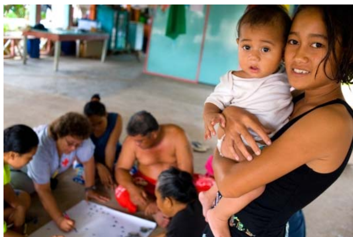
In Samoa, Red Cross volunteers and community members gather after the tsunami to map risks from disasters and health emergencies to help prepare for future events.

This report covers the period 01/07/2009 to 31/12/2009.