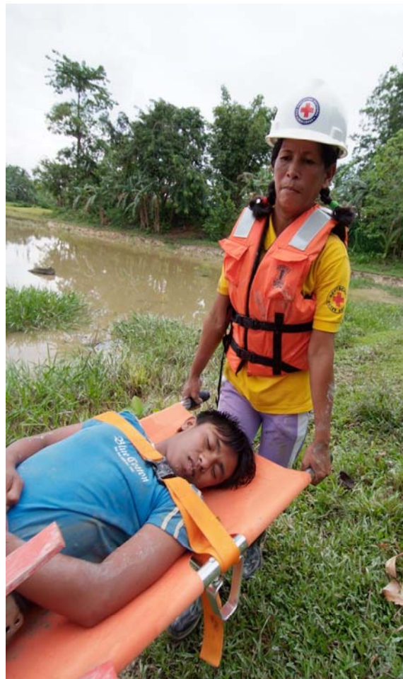
The Philippine National Red Cross providing first aid to those in need.

The consecutive and calamitous typhoon disasters of the latter half of 2009 has required PNRC headquarters and the chapters on the main island of Luzon, which were most significantly affected by the typhoons, to devote much of its energy towards search and rescue, provision of relief, and now at the end of the year, in delivery of recovery services. The latest operations update on the typhoons operation can be found here .