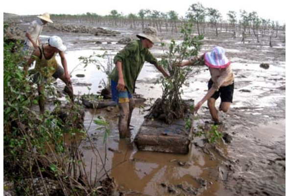
Mangrove plantation in Hai Phong, July

Disaster response training covering first aid, search and rescue and evacuation skills: 12 training sessions were delivered for 255 commune staff and community volunteers in the provinces of Quang Ninh, Hai Phong, Thai Binh, Nam Dinh, Nghe An and Ha Tinh.