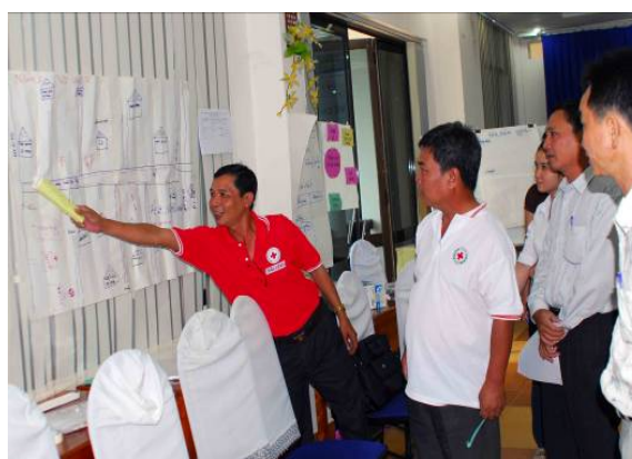
Strategy planning discussions in Hanoi, October

During the third quarter, the working team on strategy development (which included IFRC staff) reviewed various relevant national and international documents, policies and strategies, including studying Strategy 2020 of IFRC. Similarly, various internal meetings were organized to develop a final outline for the new VNRC strategy; key staff from various departments at headquarters participated. The outline and draft developed from these meetings was later shared with participants at two regional workshops held in October and November. As many as 56 of the total 63 Red Cross chapters participated in these workshops. The remaining seven chapters were unable to participate due to ongoing emergency response operations for floods in the central provinces of Viet Nam. The outcomes of these workshops contributed to defining VNRC core areas of work and priorities for the period 2011-2020. A final draft from this process was ready by end-December for submission to the executive committee meeting in January 2011 for approval.