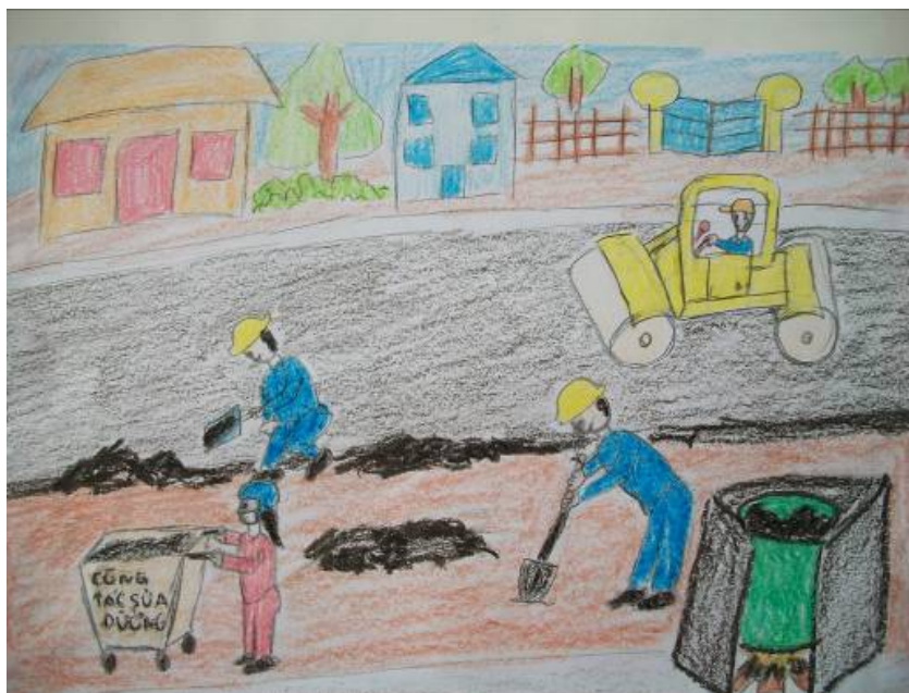
Children's drawings illustrate health risks examined during community-based health and first aid training in Can Tho province.

This report covers the period 1 July to 31 December 2010