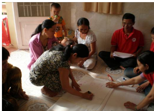
Participants of CBHFA training, Bentre City, November

Dengue prevention and control activities as part of the ' health risk management in changing climate ' project have also progressed well. A knowledge, attitude and practices (KAP) study on dengue fever and climate change has been implemented in 20 communes in Hochiminh and Tien Giang province. Some 20 VNRC staff were trained in quantitative data collection in order to implement the study. The study used both quantitative and qualitative methods and will serve as the baseline for designing behaviour change communication materials on dengue fever and climate change education for community members. VNRC also held meetings with local health authorities to negotiate areas of cooperation around information sharing and early warning for dengue fever in selected communities.