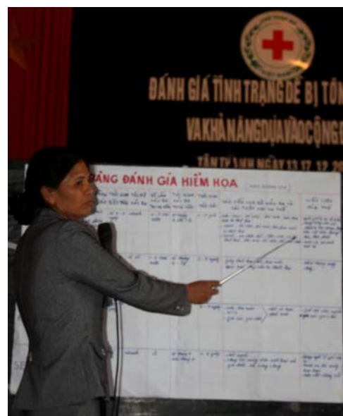
Working with Tan Thanh commune in Hai Phong on annual contingency planning

Human resource management of the implementing department still remains a huge challenge. Often, many staff are busy implementing competing objectives.