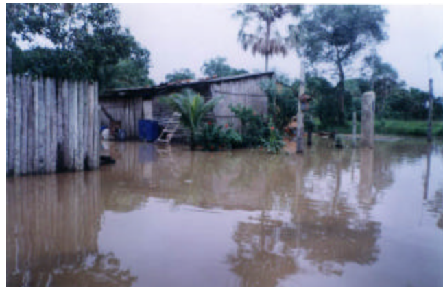
Heavy rains flooded several regions in Bolivia, leaving behind scenes like this one.

The provision of health care in Trinidad is being coordinated by the Ministry of Health, while the Bolivian Red Cross has provided medicines and first aid kits. World Vision and Doctors without Borders are overseeing basic hygiene and water and sanitation, while the United Nations World Food Programme and USAID are taking care of food aid assistance. The spread of epidemics is a major concern at present in Trinidad as there is no sewage system. Another issue is that evacuees from nearby communities that were also affected by the floods are overcrowding the Trinidad shelters.