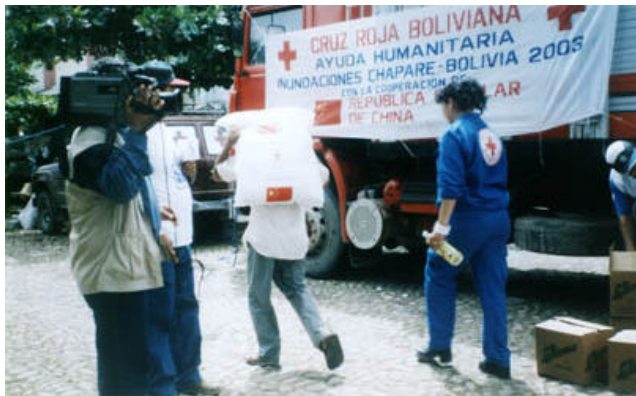
Families from the communities of Ibuelo, Dorado Grande, Dorado Chico, San Luis, Florida, Villa Fernandez, Santa Rosa de Ibuelo and Manuel Asencio Padilla benefited from the BRC food aid distribution in Villa Tunari on 10 January.

In December 2003, the government of the People's Republic of China responded immediately to the emergency in Chapare with a donation of USD 50,000 to Bolivian organizations. From this amount, USD 10,000 dollars were allocated to the Bolivian Red Cross (BRC), at the request of the Red Cross Society of China. The funding was used to conduct a damage and needs assessment and to deliver humanitarian aid to some 490 families in Villa Tunari. Food packages were distributed on 10 January, with each 40-kilogram food package containing rice, sugar, pasta, flour, oil and salt. The packages were designed to provide food to a family of five for one month. In total, BRC food packages benefited 2,450 people.