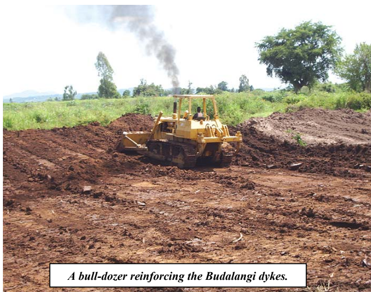
A bull-dozer reinforcing the Budalangi dykes.

In Budalangi, trained RCAT members and community members are scheduled to use 3,000 gunny bags to patch up and reinforce the dykes. Kobuya and Kobala in Rachuonyo dug shallow trenches through the government Food For Work approach. Kogembo residents dug shallow trenches through their own initiative.