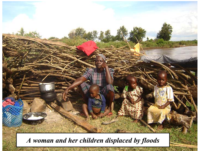
A woman and her children displaced by floods