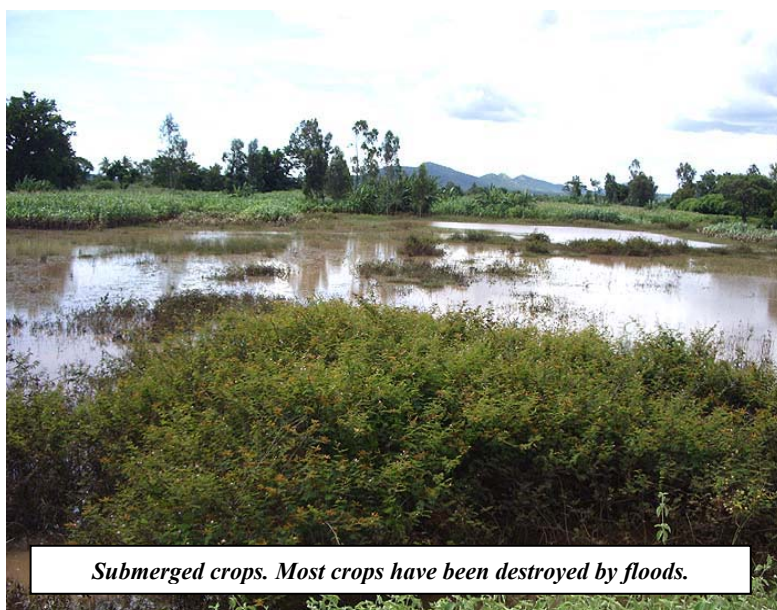
Submerged crops. Most crops have been destroyed by floods.

Kenya started experiencing the long rains season since March 2006 and in the middle of a biting drought that has affected 3.5 million people. Coast, North Eastern, parts of Eastern, Central, Nairobi, Western and Nyanza Provinces have registered high levels of rainfall. A number of people have been reported dead due to the floods. Crops and some houses have been submerged and damaged, while roads in parts of the country have been rendered impassable or damaged. Some communities were displaced for a short while but returned their houses even though their houses were still wet. Most drinking water sources for the communities are feared to have been contaminated by pit latrines that had over flown.