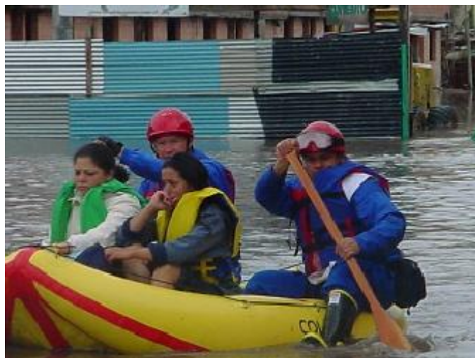
Colombian Red Cross Society volunteers in action

Surveys and damage and needs assessments are now being finalized in coordination with the government. The Pan American Disaster Response Unit (PADRU) continues to monitor the situation together with the CRC and will mobilize a Regional Intervention Team (RIT) member to support the relief operation.