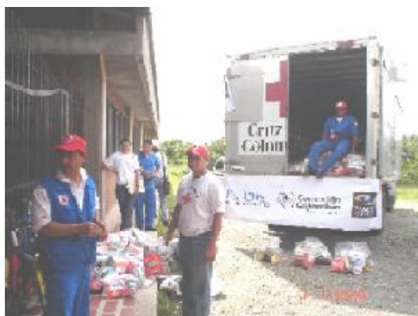
Distributions take place in Buenaventura, Valle, with the collaboration of Conexi o n Colombia