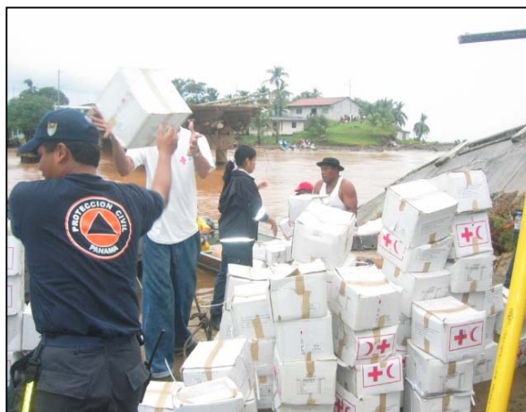
Federation relief items being distributed in coordination with SINAPROC

From the onset of the disaster the National Society has been in close contact and coordination with Federation's Pan American Disaster Response Unit (PADRU). A Regional Intervention Team (RIT) member specialized in Water and Sanitation as well as the IT and Telecommunications expert from PADRU have been deployed to the field. Furthermore, a telecommunications kit including a VHF system and repeaters, an HF system, generators, a laptop, a GPS and satellite phones was sent to the field to restore communication between the provinces of Colón and northern Coclé, and isolated communities.