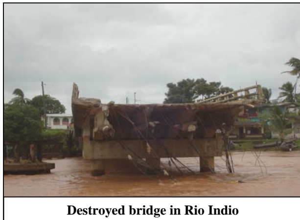
Destroyed bridge in Rio Indio

The Red Cross Society of Panama has been involved in this emergency in the provinces of Colón, Coclé and Panama.