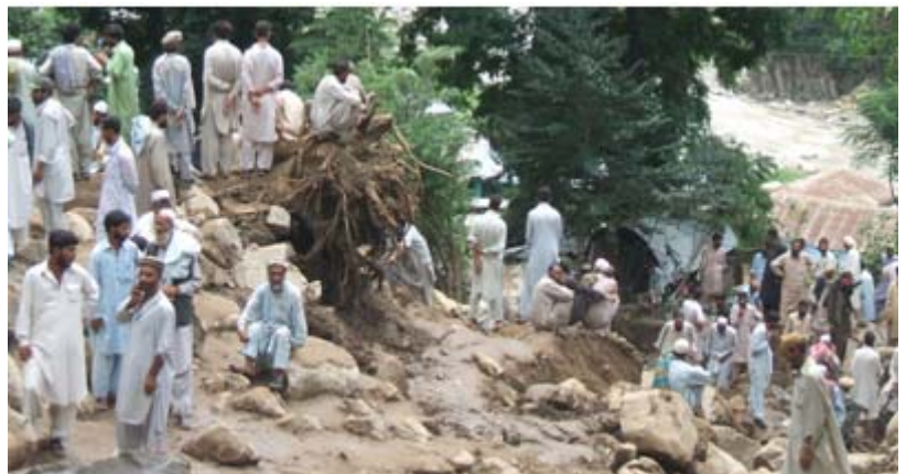
Jaboori village in the Siran Valley was smashed by torrential floods, uprooting trees and sweeping away houses.