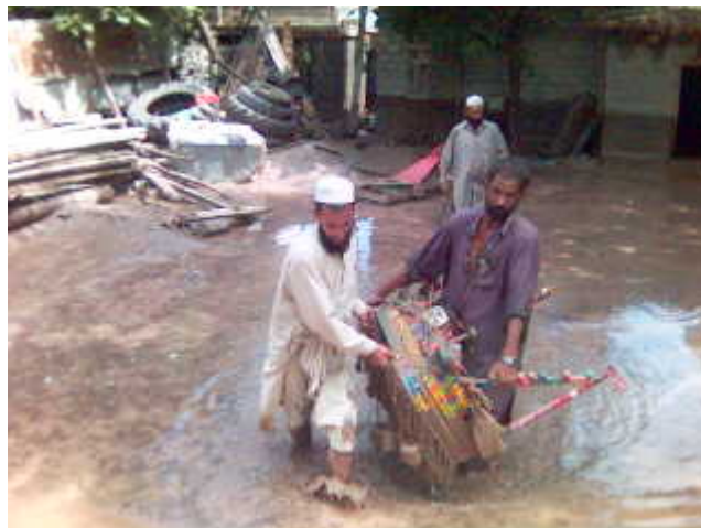
Villagers in Gul Dheri cleaning up after the Kunhar river broke its banks and swept through the village, damaging 400 houses.

A three-member PRCS monitoring team in Siran Valley is providing support to local communities moving to safer ground.