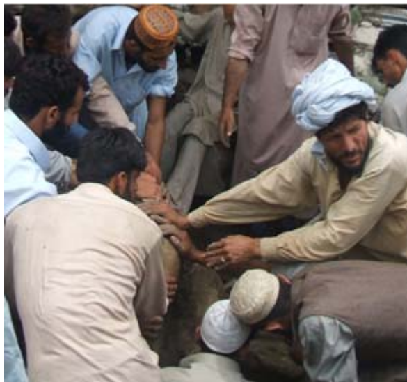
Villagers in Jaboori, where eight people died, attempt to move flood debris with their bare hands.