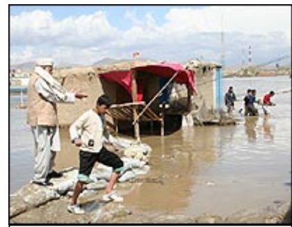
Flooding, caused by heavy rain, in Kabul city

As a result of a surge of floods in Kunar province in the eastern part of the country on 25 th June, seven people died and three people are still missing. The floods also destroyed houses, agricultural land and orchards, bridges, roads, dams and power supply in the area. In the neighbouring Nangarhar province, 69 houses were destroyed in some areas, particularly in Sorkhrod district. In Kama district, 40 people were evacuated by Ministry of Defence helicopters.