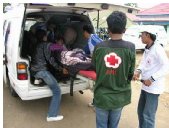
Indonesia Red Cross workers rush a wounded man to hospital following the powerful earthquake which hit near the Sumateran city of Bengkulu on Thursday."

In response to PMI chapter operations, the headquarters has dispatched many relief items to Bengkulu from its central and regional warehouses. Total relief items sent to Bengkulu are as below.