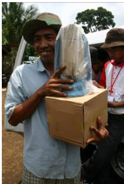
PMI Volunteers distribute relief items to beneficiaries of Lais sub district of Bengkulu Utara district.

* Joint operation with SurfAid International. Items are on the way to Mentawai.