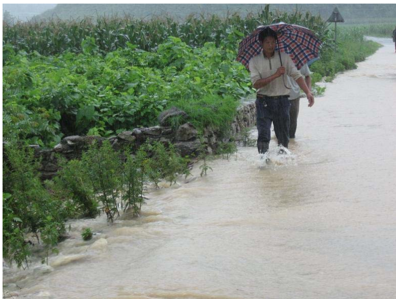
Villagers in scenic Yangshou near Guilin, in Guangxi province, walk along their flooded crops. The loss of farmland and the subsequent inflation of vegetable prices is of increasing concern in China this season.

The branches of the Red Cross Society of China have responded in their respective areas, where needed. The Guangdong Red Cross branch has sent CNY 750,000 (CHF 109,000) worth of relief supplies to flood hit areas. As early as 2 June, the Guangdong Red Cross branch distributed 50 tonnes of rice and 2,000 family first aid kits to those in flooded areas. By 16 June, the branch had dispatched three assessment teams, which distributed an additional 500 family first aid kits and ten tons of rice each, resulting in a total of 1,500 first aid kits and 30 tonnes of rice being delivered to beneficiaries on 16 June. The RCSC headquarters has provided the branch 50 sprayers, 1,500 mosquito nets, 500 boxes of water purification tablets, and 500 boxes of environmental disinfectants.