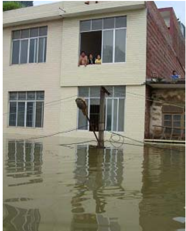
People of He Chi village in Guangxi province wait for rescuers to help them escape the rising flood waters.

<click here to view the map of the affected area, or here for detailed contact information>