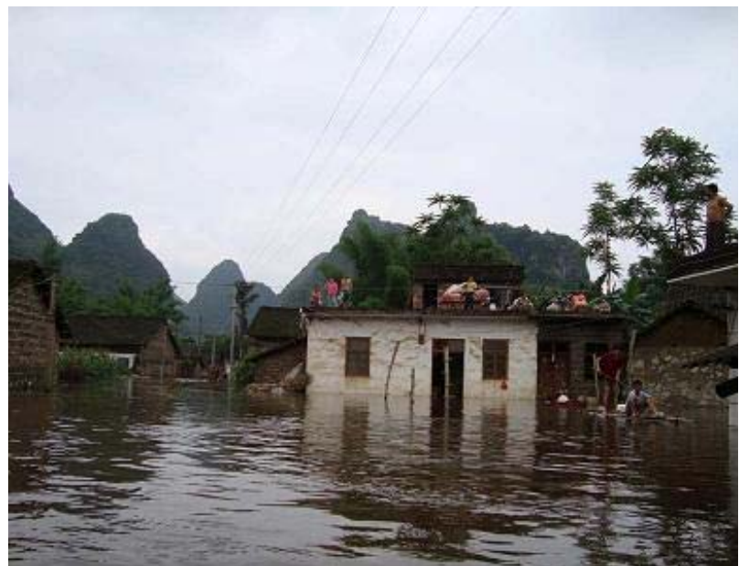
Villagers take refuge on the roofs of houses and float to safety on makeshift rafts in He Chi village, Guangxi province. RCSC