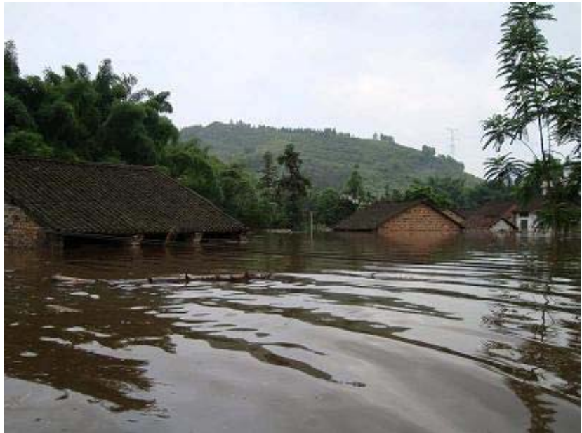
The RCSC found He Chi village in Guangxi province submerged in water when they arrived to bring relief supplies. RCSC

Based on a four level system of rating disasters (1 being most severe), the Chinese government has activated emergency disaster relief response Level 2 to some areas in Guangxi province, and Level 3 to other areas of Guangxi, Guangdong, Hunan and Jiangxi provinces.