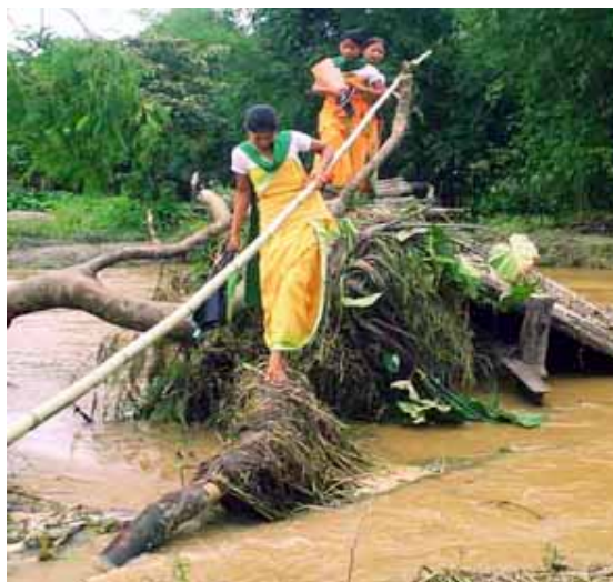
Schoolgirls crossing over an uprooted tree in flood-affected Sonitpur district in the state of Assam

click here to view the map of the affected area and here for detailed contact information