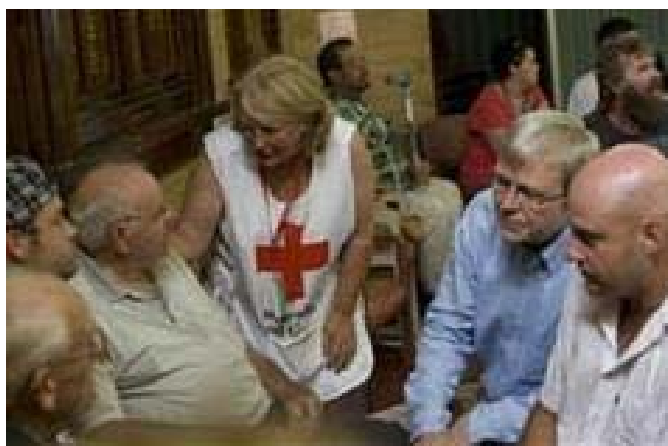
The Australian Prime Minister (blue shirt) visited the Whittlesea relief centre which provides relief assistance to many bushfire survivors.

Australian Red Cross reported a severe heatwave and wildfire situation in Victoria on 7 February 2009. As of 12 February 2009, the Australian Red Cross reports that more than 180 people are confirmed dead, and this figure is expected to rise. It also reports that more than 400,000 hectares of land are affected and the fires have also destroyed more than 1,000 homes.