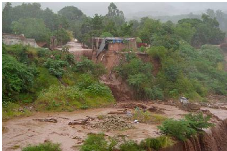
Houses suffered severe damage due to the landslide.

The International Federation's, Pan American Disaster Response Unit (PADRU and the Regional Representation Office for the Southern Cone are monitoring the situation and keeping close communication with the ARC in case assistance is needed for this emergency.