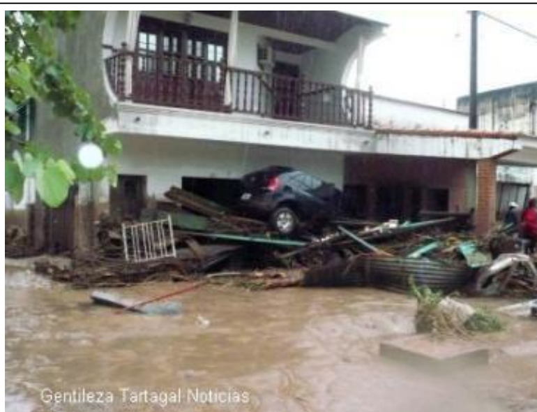
Flooded street in the city of Tartagal in the province of Salta.

<Click here to view the map of the affected area, or here for detailed contact information>