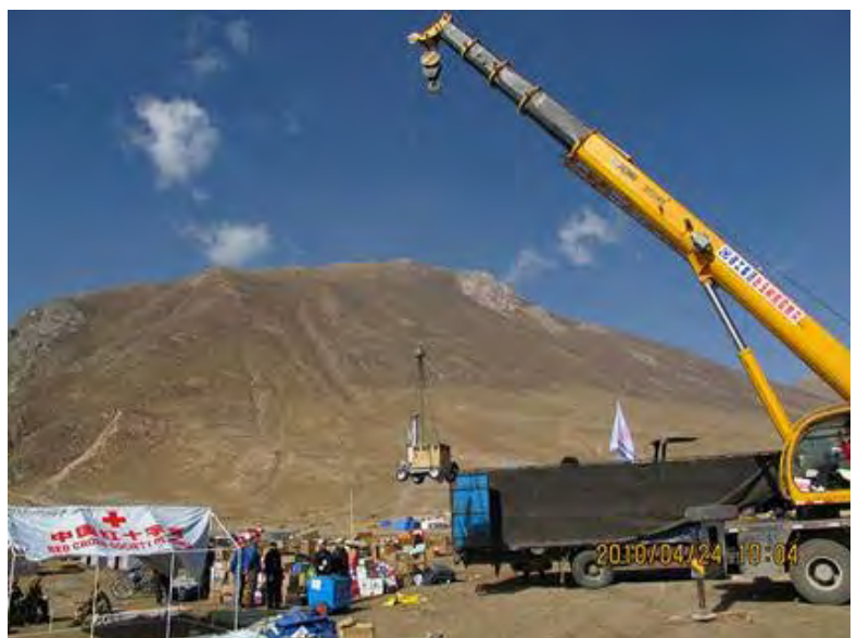
The sanitation emergency response team from Yunnan provincial Red Cross set up latrines in Yushu.