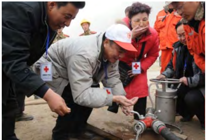
The Red Cross Society of China water emergency response team from Hunan successfully set up emergency clean water supply facility in Yushu.

Rescuers acclimating to the high altitude have stepped up measures to ensure environmental hygiene, with particular efforts made to prevent the outbreak of an epidemic. Relief supplies were being delivered to the quake-hit area around the clock by air and by road. Despite continuous challenges due to bad weather conditions that have been affecting access roads, many of which meander along mountains at over 4,000 metres, teams of relief workers and the local government continue to be on guard to ensure these lifelines remain passable.