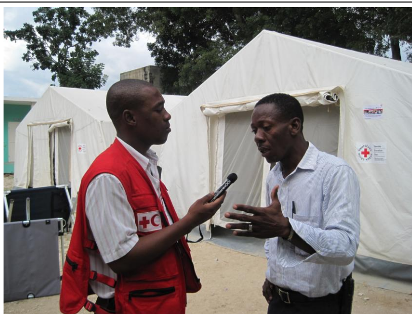
IFRC beneficiary communications unit interviewing a doctor and a patient (former CTC of the German Red Cross in Arcahaie).

The IFRC Emergency Health Coordinator has been deployed to Santo Domingo; the component of the current