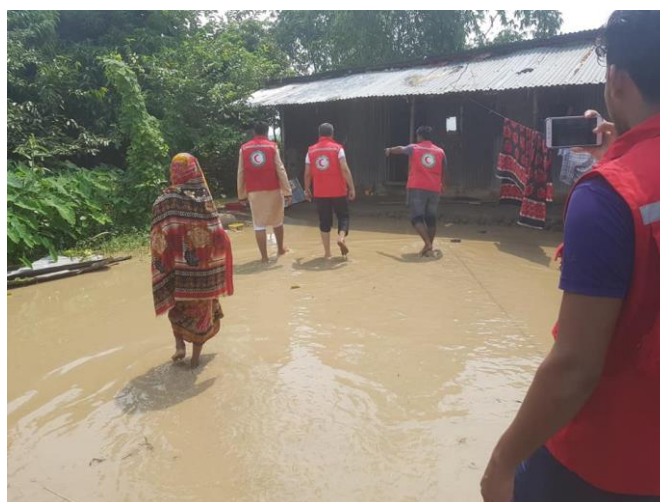
Red Crescent NDRT team assessing the flood situation in Netrokona district.

While coordinating closely with the government at national and district levels, Bangladesh Red Crescent Society (BDRCS) together with Red Cross and Red Crescent (RCRC) Movement partners is closely monitoring the situation. BDRCS has attended an inter-ministerial coordination meeting called by the government on 12 July 2019. BDRCS also organized a RCRC coordination meeting on 13 July 2019 at its National Headquarters (NHQ) in Dhaka where IFRC, International Committee of the Red Cross (ICRC) and in-country Partner National Societies (American Red Cross, British Red Cross, Danish Red Cross, German Red Cross, Swedish Red Cross, Swiss Red Cross, Turkish Red Cross) joined. 200 Red Crescent Youth (RCY) volunteers and 20 staff are already engaged and continuously monitoring and supporting the situation in different districts. BDRCS has set up a central hotline number in its NHQ which is open daily from 9:00am to 5:00pm. BDRCS has also allocated hygiene parcel boxes for the following districts: Netrokona (500 boxes), Bandarban (500 boxes), Chattagram (400 boxes), Sunamganj (400 boxes), Rangamati