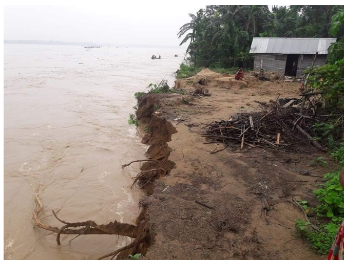
Worsening flood causing riverbank erosion in Netrakona district.

According to the Bangladesh Meteorological Department and India Meteorological Department, there is a chance of medium to heavy rainfall and in some places very heavy rainfall in the north, north-eastern and south-eastern parts of Bangladesh along with adjoining Sikkim, Northern West Bengal, Assam and Meghalaya states of India in the next 24 to 48 hours. In addition, it is forecasted that medium to heavy rainfall may occur in the north-west region and adjoining Bihar, West Bengal and Nepal.