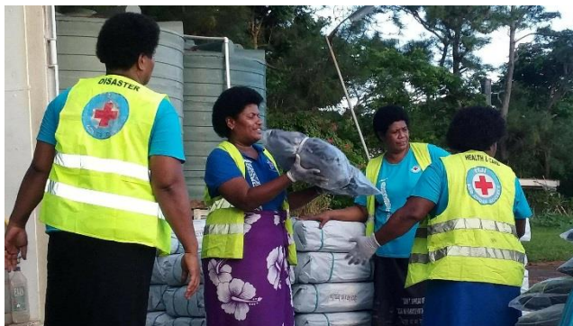
Fiji Red Cross Society, Sigatoka Branch in the Western Division prepositioning relief items

All branches in the western division have allocated skeletal team in Branch EOCs. A briefing with the National Office and the Western Divisional EOC Office was conducted on the morning of 9 April to update staff and volunteers of the current weather conditions and the proposed Emergency Plan of Action for TC Keni. A total of 37 volunteers remain on standby as skeleton EOC teams in all Western Branches and their homes, including ERT trained volunteers. Preparedness on water, sanitation & hygiene issues continues to be prioritized in initial plans of the Western EOC and all Western Branch EOCs in the aftermath of the TC Josie response and in the lead up to preparations for TC Keni. Prioritization of updating stocks for key NFIs such as jerry cans/water containers, hygiene kits and dignity kits in branches is ongoing. Stocking and purchasing of personal protection equipment for volunteers for protection from diseases easily spread in affected communities.