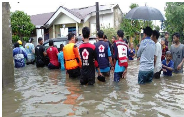
PMI volunteers are supporting the rescue of people affected by the floods in South Sulawesi, (Photo: PMI)

However, the decision caused Jeneberang river to become overflowed and flooded the area of Gowa District. Furthermore, the overflowed Jeneberang river caused Manuju bridge to collapse. The bridge used to connect Gowa district and Moncongloe village.