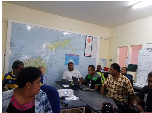
Fiji Red Cross Staff and IFRC CCST Suva Team discussing on TC Mona Plan of Action.

In order to mobilize its volunteers and assets for first response actions and assessments, FRCS will make a DREF application that is expected to be submitted on Friday, 4 January 2019.