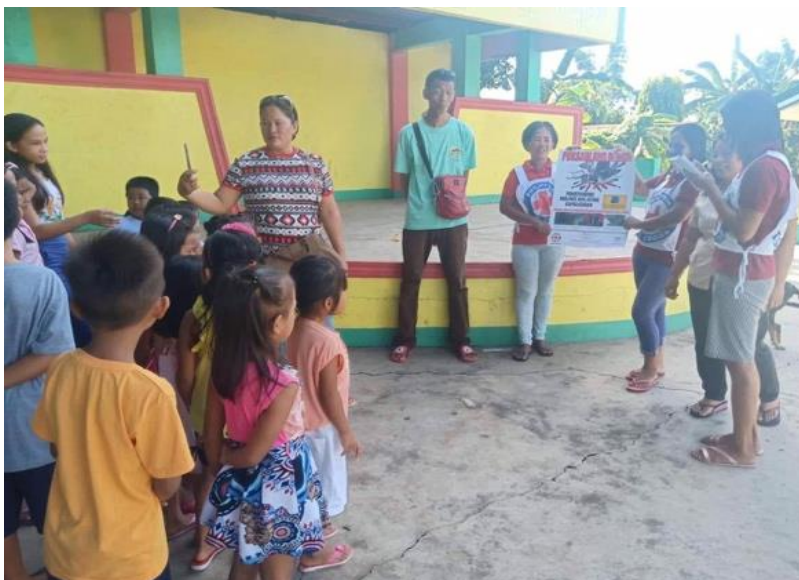
Children listening attentively to PRC volunteers doing dengue awareness and prevention campaign in Camarines Sur.

On Monday, 15 July 2019, the DOH has declared a national dengue alert amid the surge in reported cases of the mosquito-borne viral illness. The national dengue alert was issued to urge regional DOH offices to step up dengue surveillance, case management and outbreak response in primary health facilities and hospitals, as well as through community and school-based health education campaigns, clean-up drives, surveillance activities, case investigations, vector control, and logistics support for dengue control (insecticides, rapid diagnostics tests, medicine, etc).