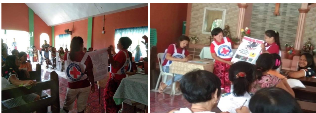
PRC Volunteers conducting dengue awareness and prevention session in Camarines Sur.

The IFRC Philippine country office has been coordinating with the National Society, Movement partners in-country and the Humanitarian Country Team in support of PRC coordination. The IFRC Philippine country office is also coordinating and providing updates to the Asia Pacific regional office in Kuala Lumpur, Malaysia.