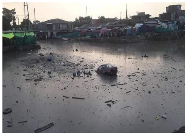
The impact after the flash floods hit Parwan District early in the morning.

According to ARCS Emergency Operation Centre (EOC) report, torrential rains since 25 August 2020 in 13 provinces (Parwan, Maidan Wardak, Nangarhar, Nooristan, Laghman, Panjshir, Kapisa, Kabul, Pakia, Logar, Khost Paktika and Ghazni) have resulted to flooding on 26 August 2020 that caused 95 deaths, 137 person injured and three others missing as well as 767 houses damaged and 147 livestock died.