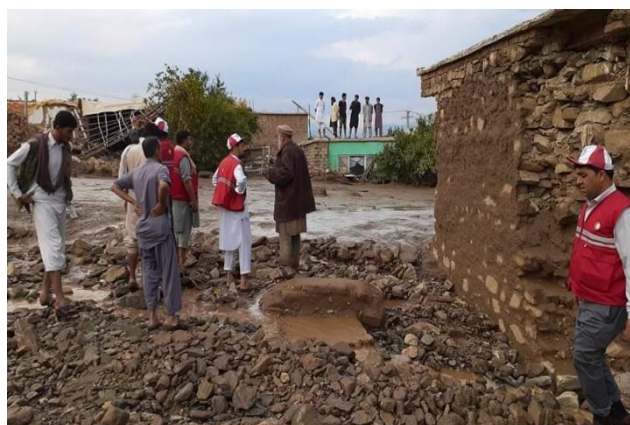
ARCS response team assessing the impact and extending search and rescue effort at Parwan province.

Localized floods caused by heavy rainfall were reported on the early morning of 26 August 2020 in Parwan City and Mandi Village in Nooristan province, Rodat district in Nangarhar province, Mehtarlam and Alishang districts in Laghman province, and Parcha and Charikar districts of Parwan province. Although the damage is widespread, Parwan province is currently the most severely affected by the floods. Early information shared at PDMC meeting on 27 August 2020 indicates approximately 100 people have died and 100 people injured. Approximately 500 houses have been either partially damaged or destroyed that caused approximately 300 to 400 families to be displaced. Power and water systems are also reportedly damaged, while agricultural land and public infrastructure have also been impacted. Joint assessment teams have been initiated. Government authorities are currently leading search and rescue operations.