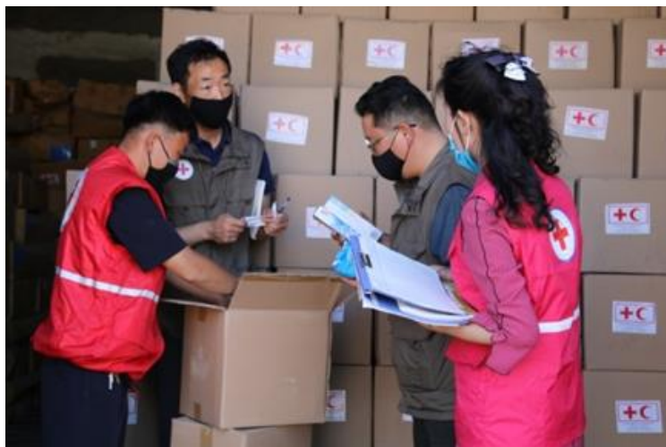
NDRT members checking the storage of essential household items.

disasters like flood and landslide. In total 43,200 Red Cross volunteers throughout the country are mobilized to disseminate early warning and early action messages (such as weather forecast information and evacuation routines) and to keep watch on the disaster risk factors like river level, landslide risk, etc. Under the current situation that the state emergency anti-epidemic system in DPRK has turned into the maximum emergency system to prevent spread of COVID-19 into the country, Red Cross volunteers are following specific anti-epidemic measures like wearing masks, keeping social distance, avoiding gatherings of more than five people and disseminating COVID-19 protection messages to the affected population during evacuation and relief item distribution. These volunteers are trained in COVID-19 protection and provided with necessary personal protective equipment.