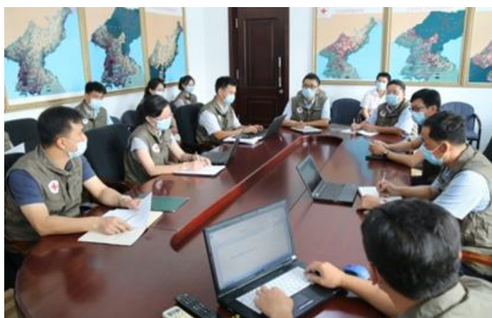
NDRT meeting for effective and timely response to possible disasters during the rainy season.

Pre-disaster meetings were organized to strengthen the cooperation and coordination with governmental authorities including State Committee for Emergency and Disaster Management (SCEDM), State Hydro-Meteorological Administration (SHMA) and Central Bureau of Statistics (CBS). Regular contact with these organizations is being maintained and meteorological and other data are being shared.