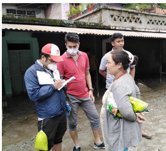
One of the Red Cross Red Crescent colleague conducting the initial rapid assessment in the landslide affected area of Sindhupalchok district.

NRCS has deployed at least nine Red Cross Red Crescent trained volunteers in the ground to provide various immediate response like initial assessment, search and rescue, first aid, evacuation and immediate relief as needed. NRCS volunteers are also mobilized by all affected NRCS district chapters and are working continuously together with local authorities to conduct Initial Rapid Assessment (IRA) and relief distribution as well as support communities to be safe and prepared for the worsening floods.