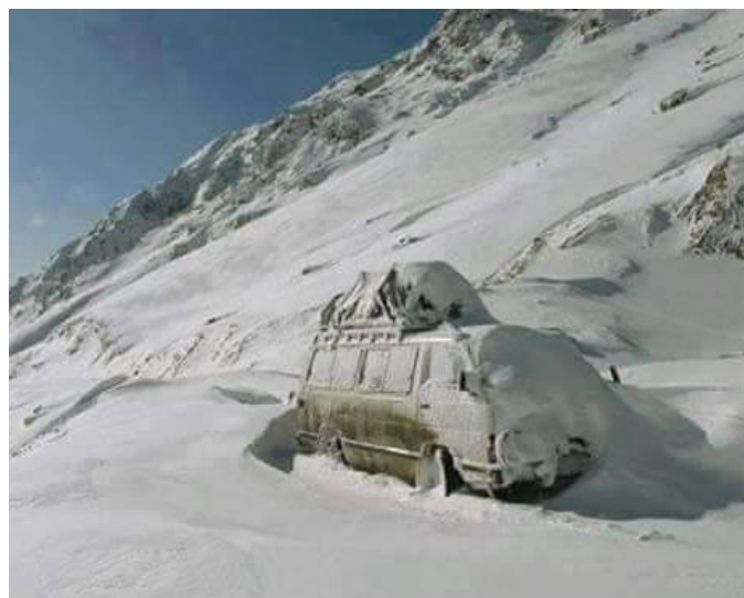
A public transport vehicle stuck in snow due to heavy snowfall in Baluchistan, January 2020.

Due to heavy snowfall, the highways: Quetta-Sibi, Quetta-Karachi and Quetta-Zhob, are blocked. Quetta, Ziarat, Harboi, Kan Mehtarzai, Muslim Bagh, Khanozai and Khojak Pass were blanketed in snow. In District Kharan, Panjgoor and Gwadar heavy rains were reported which resulted in flash-flooding in different areas of mentioned districts.