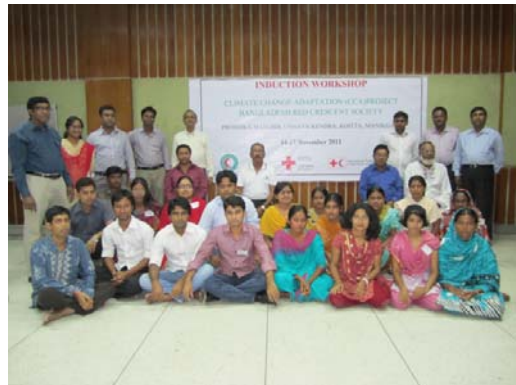
Participants of the climate change adaptation project induction workshop.

A knowledge management framework has been prepared for BDRCS as part of the preparation for establishing the knowledge management system, in line with the BDRCS mandate to Bangladesh Climate Change Strategy and Action Plan (BCCSAP) 2009 and DRM strategy 2010-14. This framework will ensure the smooth information flow within BDRCS and with relevant actors in CCA as well as between the communities. A project brochure has been prepared both in English and Bangla. The activities related to publishing e-newsletter and offering a fellowship for the first year is in progress. BDRCS is exploring collaboration with the EPFL and other local universities, such as University of Dhaka and BRAC University amongst others to offer the advanced course in CCA/DRR. To facilitate knowledge management activities under the project a voluntary advisory group consisting of CC/DRR experts in Bangladesh has been formed.