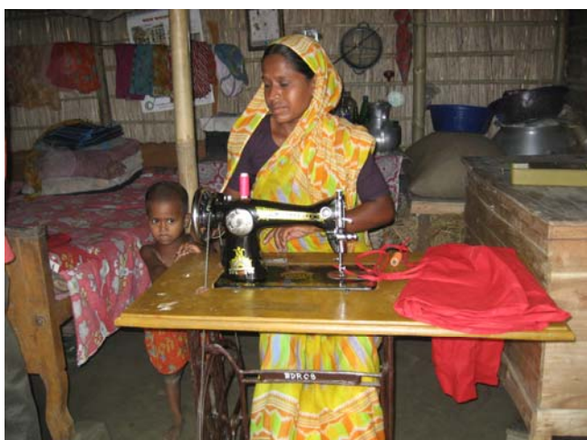
A woman from the earning income through tailoring work. She got the sewing machine from the project.

1. Small scale livelihood tools support to nine communities (boat, fishing net, rickshaw, carpenter tools, meson tools, electrician equipment, handicrafts tools, etc.) : Some beneficiaries have been identified during the review of VCA findings done earlier for providing assistance in the form of livelihood input either tools or capital. Accordingly a plan of action (PoA) for the implementation of