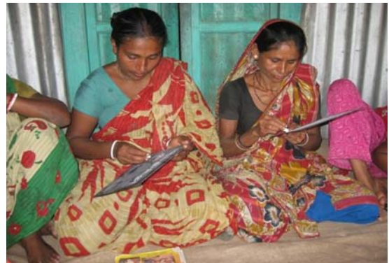
Community women in the adult literacy class enthusiastically learning basic reading and writing.

Health and Education Sector: (Expected sectoral outcomes: Health awareness is increased and primary health care and first aid services are available in the community itself. Communities are better prepared and able to cope with possible health disasters if and when occur. Infant/child and maternal mortality rates reduced. Literacy level in the community increased significantly and number of children of school-going-age out of formal school decreased. Access and opportunity for formal education increased.)