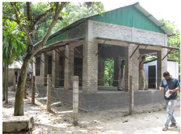
A recently constructed community information centre in Natore. CDI has constructed 8 of these centers, 1 in each community. This centre will be equipped with audiovisual equipment and internet connection to provide access to information to the community.