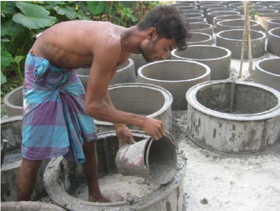
Rings for the household latrine being constructed. CDI programme is constructing rings and slabs in the communities and distributing to targeted beneficiaries.