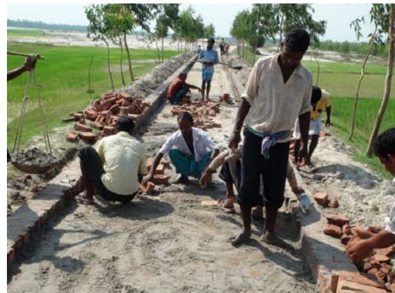
A community link road construction in progress in Baishpukur community of Nilphamari. This, the only access road, provides important access of the community to the outside markets.