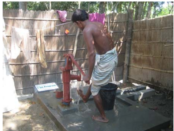
A recently repaired shallow tube well. The project repaired the pump and constructed new platform. Tested water quality and found drinkable.