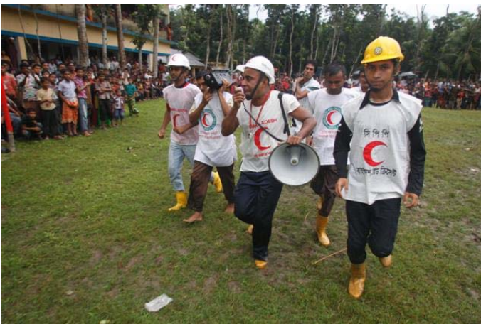
A mock drill conducted by the cyclone preparedness programme volunteers at Dwalatkhan community to disseminate cyclone warning messages.

The international procurement for 124 VHF and 42 HF radios and associated accessories from Geneva, Switzerland and the United States was done with the approval of the Foreign Ministry and Bangladesh Telecommunication Regulatory Commission (BTRC). Led by two American Red Cross emergency response unit (ERU) volunteers, the radio replacement, repairing and maintenance activities for radio rehabilitation process is being done in all zones. To date, 33 sets in 22 stations have been completed and a total of 74 HF/VHF operators underwent hands-on training on radio repair and maintenance.