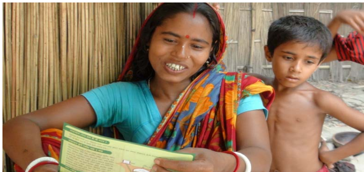
A lady reading fluently a biogas programme pamphlet. She had just completed the six-month long literacy class in Magura district.

CDI programme impact so far: Though most of the activities only started at the beginning of this year, some positive impacts are already seen and felt in communities. Despite earlier scepticism, attendance in adult literacy classes, especially women, is very encouraging. In the backdrop of the failed literacy programme (TLM) of the government, many people did not believe that a literacy programme would run in such a successful way. Women mainly in the 30-60 age group are regularly attending the class despite their household chores and other day-to-day priorities. The progress in learning as well is very encouraging and most of all learners already recognise letters and numbers and are able to write their names and read the given book. Apart from reading and writing skills, they have gained more confidence and their horizon of thinking has widened and changed positively.