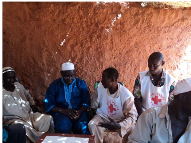
Mali Red Cross volunteers conducting door-to-door sensitization.

The National Society mobilized six regional and 39 local supervisors and 385 volunteers in Mopti and Tombouctou regions. In this social mobilization process, volunteers worked in pairs under the control of a supervisor who led a team of 10 volunteers. Each pair visited 70 households per day to conduct sensitization activities, treat water points and disinfect latrines. Volunteers carried out most of the activities in collaboration with local authorities' health officers.