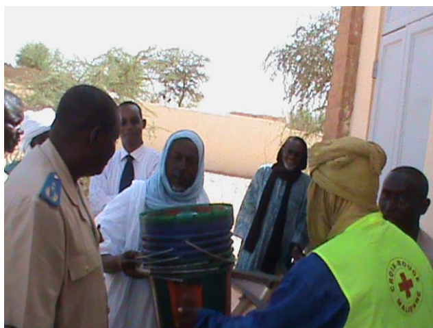
Mali Red Cross staff and partners distributed water, sanitation and hygiene-related materials to the affected population.

In August 2011, a cholera outbreak affected the regions of Mopti and Tombouctou. In coordination with government response, Mali Red Cross mobilized its relief teams, volunteers and materials to carry out complementary activities. The National Society aimed to increase the knowledge of communities on cholera and its modes of transmission. The response also included limiting the spread of cholera through improved water and sanitation. Vulnerable and affected households benefited from door-to-door visits conducted by volunteers to provide the right information regarding the disease and share key family practices related to hygiene and sanitation. The National Society mobilized six regional and 39 local supervisors and 385 volunteers in Mopti and Tombouctou regions. At the end of the operation, Mali Red Cross successfully reached a total of 212,717 people directly through its sensitization activities, and upwards of 486,200 people through community radio broadcasting. Red Cross volunteers also treated 590 water points and disinfected 11,017 family latrines.