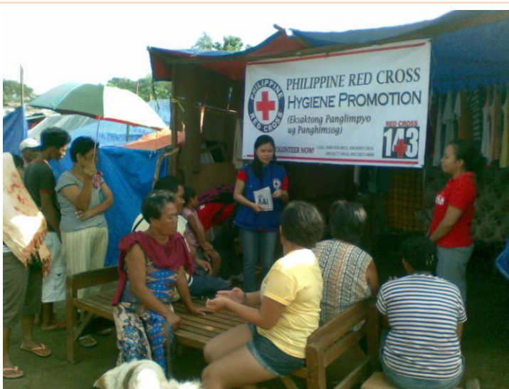
PRC CHVs reached 14,800 families with health and hygiene promotion sessions in Cagayan de Oro and Iligan.

Progress: Although part of the relief package, the distribution of hygiene kits and jerry cans is being done alongside basic health education, with focus on hygiene promotion and disease prevention. This is to ensure that families assisted with the items receive basic education on proper household and personal hygiene as well as proper handling or treatment of drinking water.