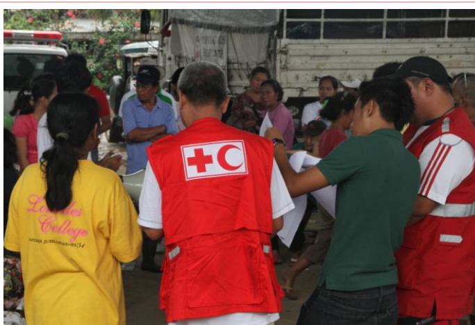
IFRC staff facilitate the distribution of shelter repair kits to 100 families in Cagayan de Oro.

Through IFRC support, PRC has provided 300 families with shelter repair kits. The shelter repair kits are being distributed using two approaches. In the first, beneficiary families are given a set of construction tools worth PHP 3,330 (CH 70) plus a commodity voucher worth PHP 6,670 (CH 140); in the second, beneficiary families are provided with cash vouchers worth PHP 10,000 (CH 210) to purchase shelter repair or construction materials at recommended shops.