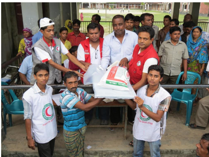
Young volunteers helping in relief distribution.

A heavy tropical storm hit some remote islands of three different coastal districts of Bangladesh at 2200 hours of 10 October 2012. The affected districts are Noakhali, Bhola and Chittagong. BDRCS quickly responded to the disaster and volunteers from the Cyclone Preparedness Programme (CPP) took part on the search and rescue. BDRCS's district units immediately coordinated with the local administration to distribute dry food (pressed rice and molasses).