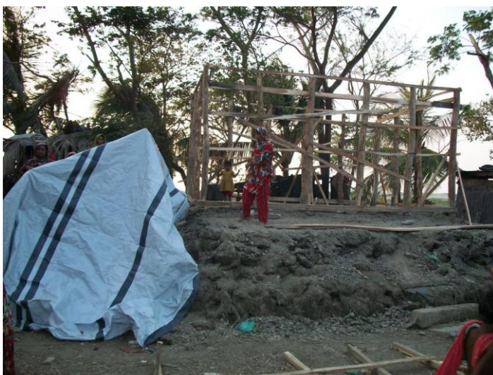
Affected people preparing their emergency shelter with tarpaulin provided by BDRCS.

BDRCS supported the same number of beneficiaries in emergency shelter as those who received food and NFIs. The 5,000 beneficiaries who received cash grant and NFIs have also received emergency shelter materials. Each beneficiary family is to receive only one tarpaulin to be used as emergency shelter support 1 . The initial assessment showed that other materials like rope and bamboo were locally available which could be used with the tarpaulin to form an emergency shelter.