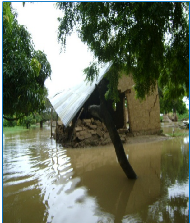
A flooded area in Benin.

The flooding that was recently experienced in Cameroon, Chad, Nigeria and Niger has now spread to Benin where up to 50'000 people in northern and central parts of the country have been affected. River Niger broke its banks causing flooding to the entire neighbouring community. The flooded communities have suffered loss of their property, crops, farm lands, livestock and displacements from their homes. The displaced households are currently residing in schools and open-air makeshift camps. The floods were expected to subside in a few days allowing those displaced to return to their homes but heavy rains received in the flood hit areas in the first week of October has resulted in continued flooding.