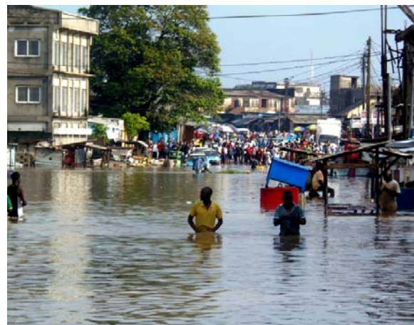
A flooded street in Pointe Noire after the rain

To date, no official figures are available, and considering the situation on the ground, it is difficult to accurately assess the scope and needs of the affected populations. Currently five deaths have been recorded.