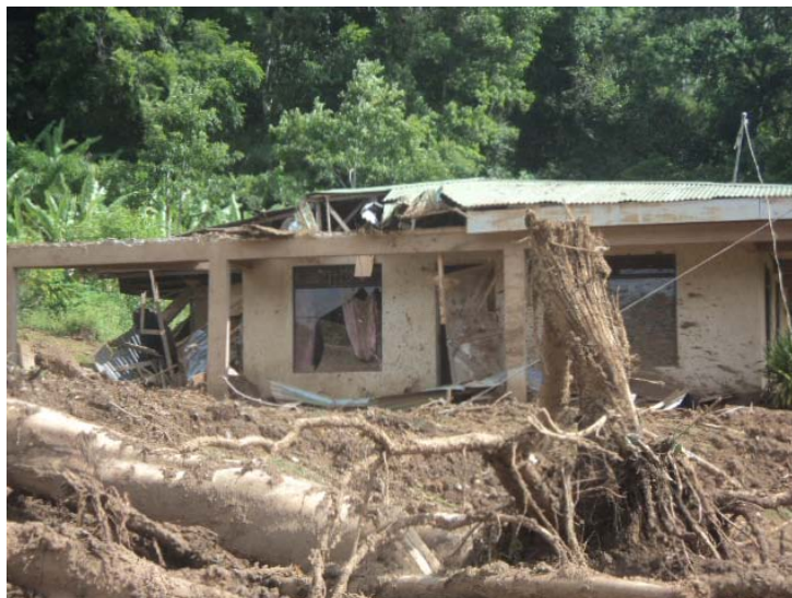
Several homes in Jimenez, municipality of Turrialba were destroyed or severely affected by a landslide after an embankment failed.

<click here for the DREF budget; here for contact details>