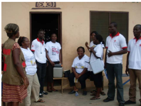
Red Cross volunteers at work

Summary: An outbreak of Cerebro-Spinal Meningitis (CSM) in the Upper East Region has claimed 23 lives in two months. As of 27 February, 2012, the number of people affected has climbed to 158, giving a case fatality rate (CFR) of 14.6 (Ghana Health Service, Upper East). Health authorities in the region are stepping up efforts to halt the spread of the disease which has assumed epidemic proportions.