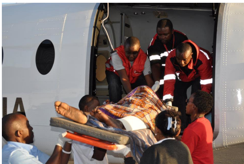
KRCS Emergency Ambulance Service airlift victim of clashes to Nairobi for specialized medical care

The conflict quickly escalated and necessitated quick response in order to save lives as the affected were either grievously wounded or displaced and living in the wild. Funds received under this DREF enabled the National Society to carry out an in-depth assessment in