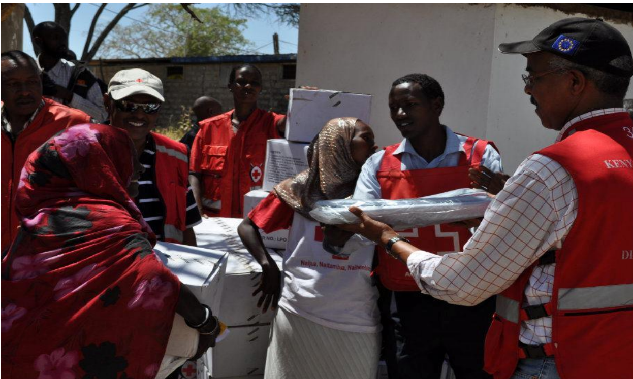
Beneficiaries receive NFI kits from KRCS secretary General and volunteers.

Disaster preparedness stocks were replenished with NFI kits that the society received from OFDA thereby ensuring that KRCS had supplies to utilize in its future response activities. KRCS sourced bilateral funds from OCHA which were utilized to procure NFI kits for 1,170 households and served to also replenish the Society's preparedness stocks.