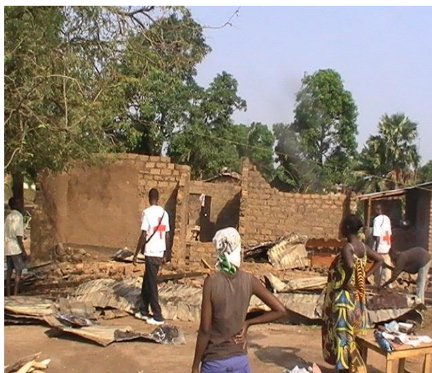
CAR Red Cross volunteers assisted affected families to retrieve personal belongings buried under rubble in the aftermath of the storm.

<click here for the final financial report, or here to view contact details>